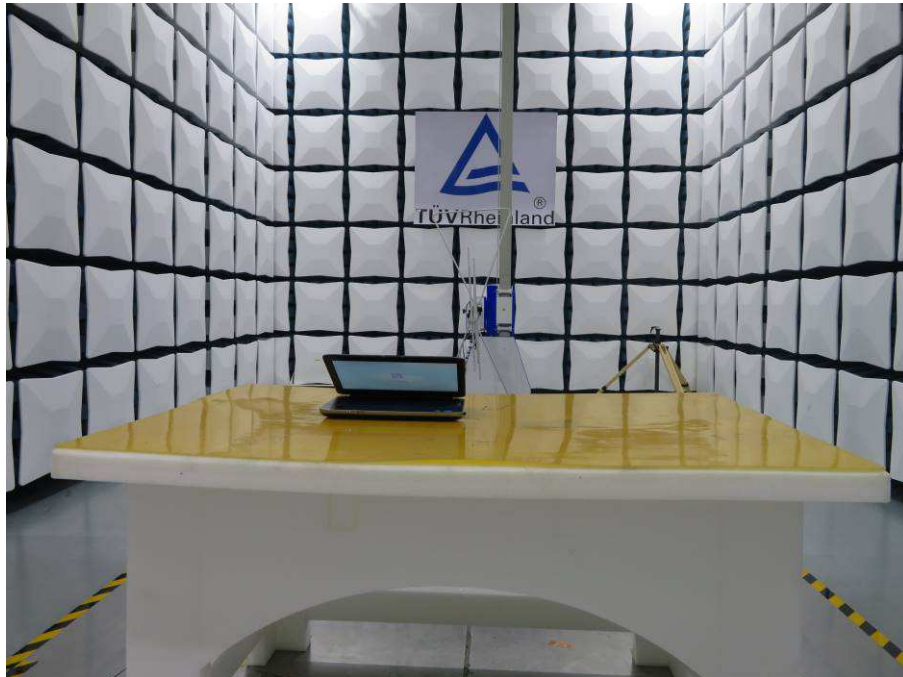
Photograph 1: Set-up photo for Radiated Spurious Emission, Below 1GHz