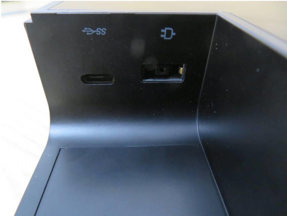
View of EUT-6