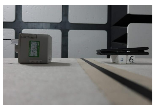
Position E Position F