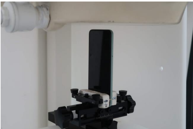
Bottom Side, Test Separation 10 mm