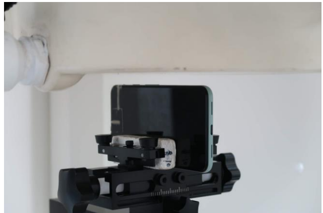
Right Side, Test Separation 10 mm