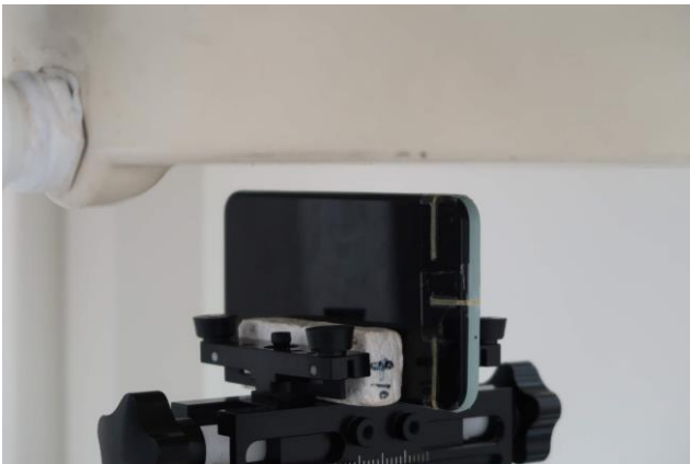
Left Side, Test Separation 10 mm