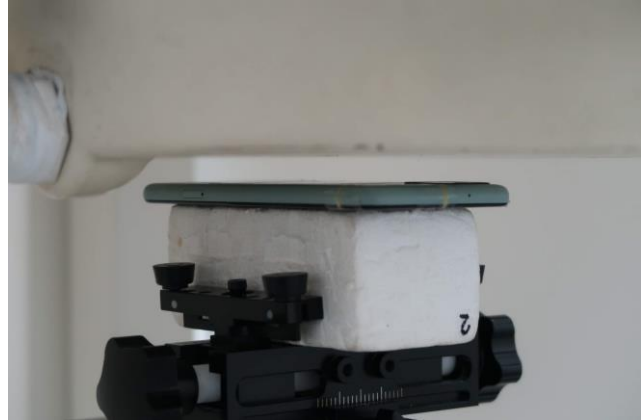
Back, Test Separation 10 mm