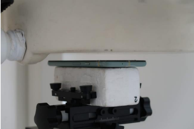
Front, Test Separation 10 mm