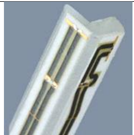
Fig 5.2 Photo of E-field Probe