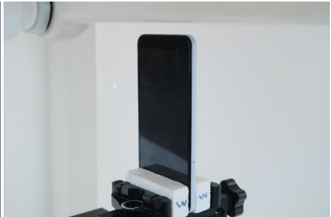
Bottom Side, Test Separation 10 mm