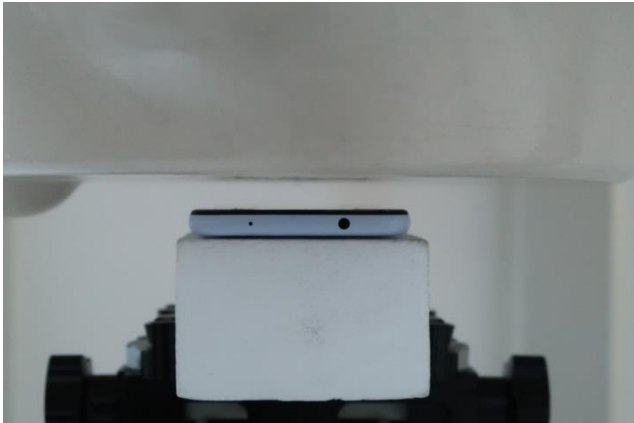
Front, Test Separation 10 mm