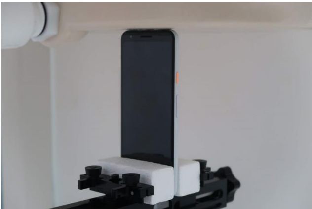
Top Side, Test Separation 0 mm