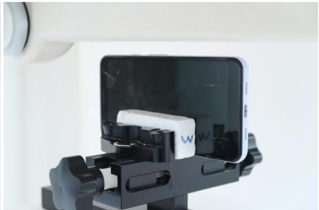
Right Side, Test Separation 10 mm