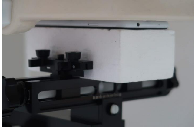
Back, Test Separation 0 mm