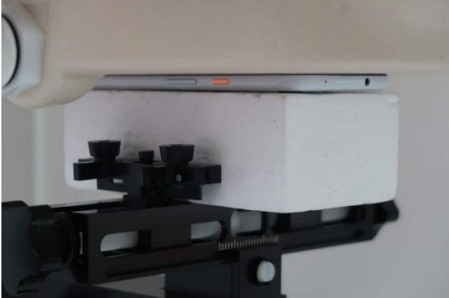
Front, Test Separation 0 mm