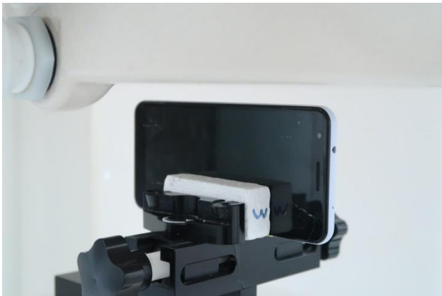
Left Side, Test Separation 10 mm