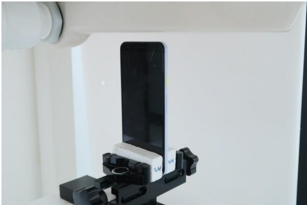
Top Side, Test Separation 10 mm