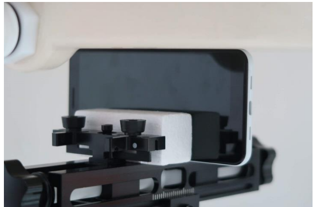
Right Side, Test Separation 0 mm