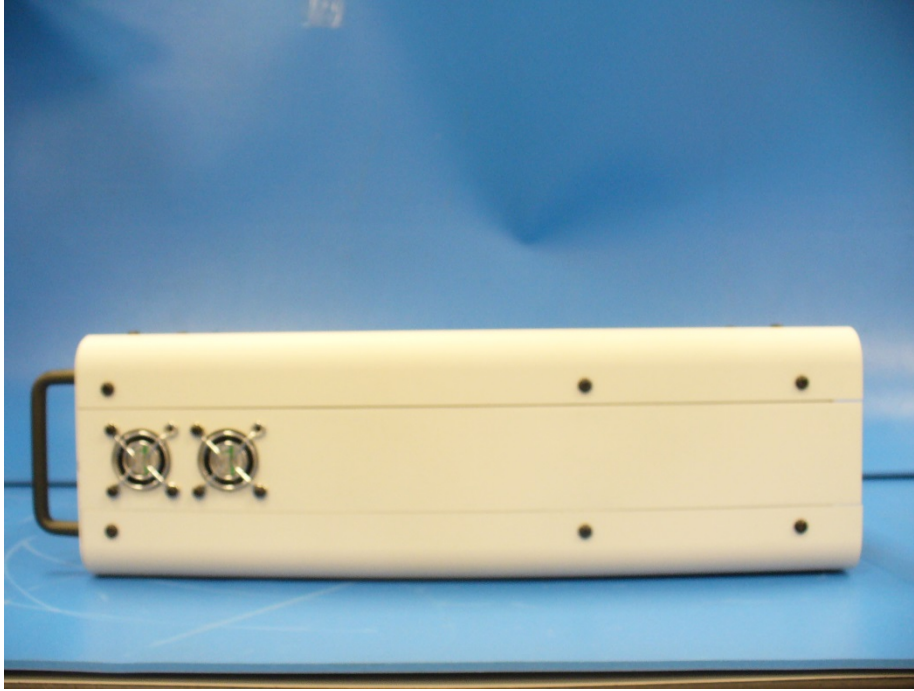
MARS BEACON ENCLOSURE LEFT SIDE