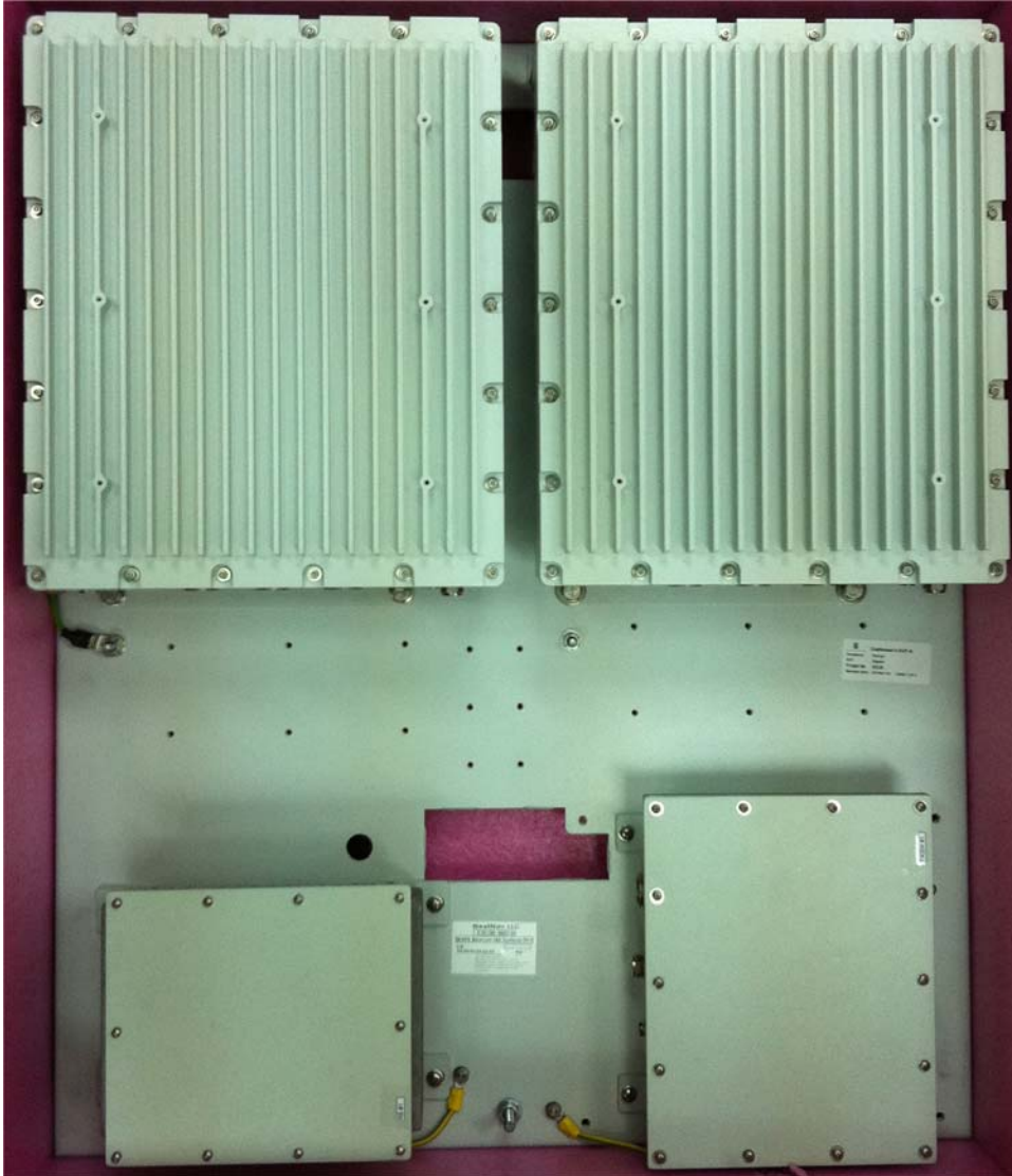
Photograph No.1 WAPS Beacon LBS system general view