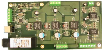
POWER SUPPLY UNIT (PSU)