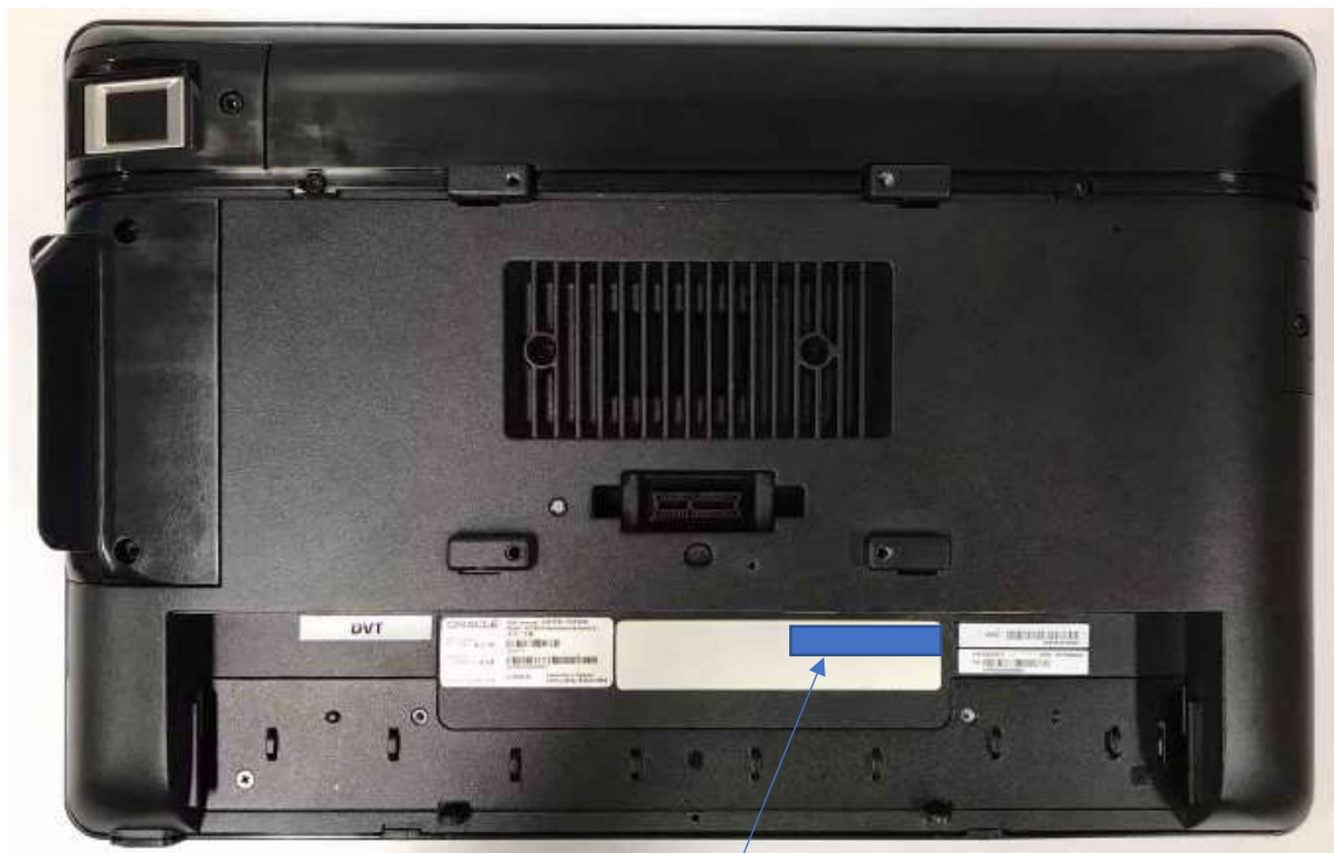
FCC ID and IC information

Label location: Product bottom, near the I.O. Panel.