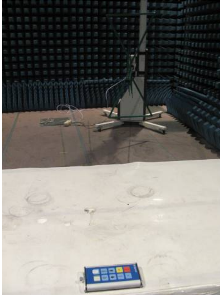
30MHz-1000MHz, X axis