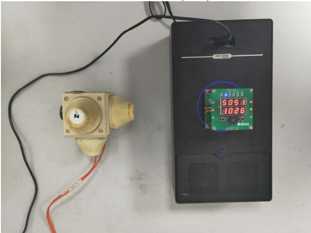
Left Side-Position A (15 cm)