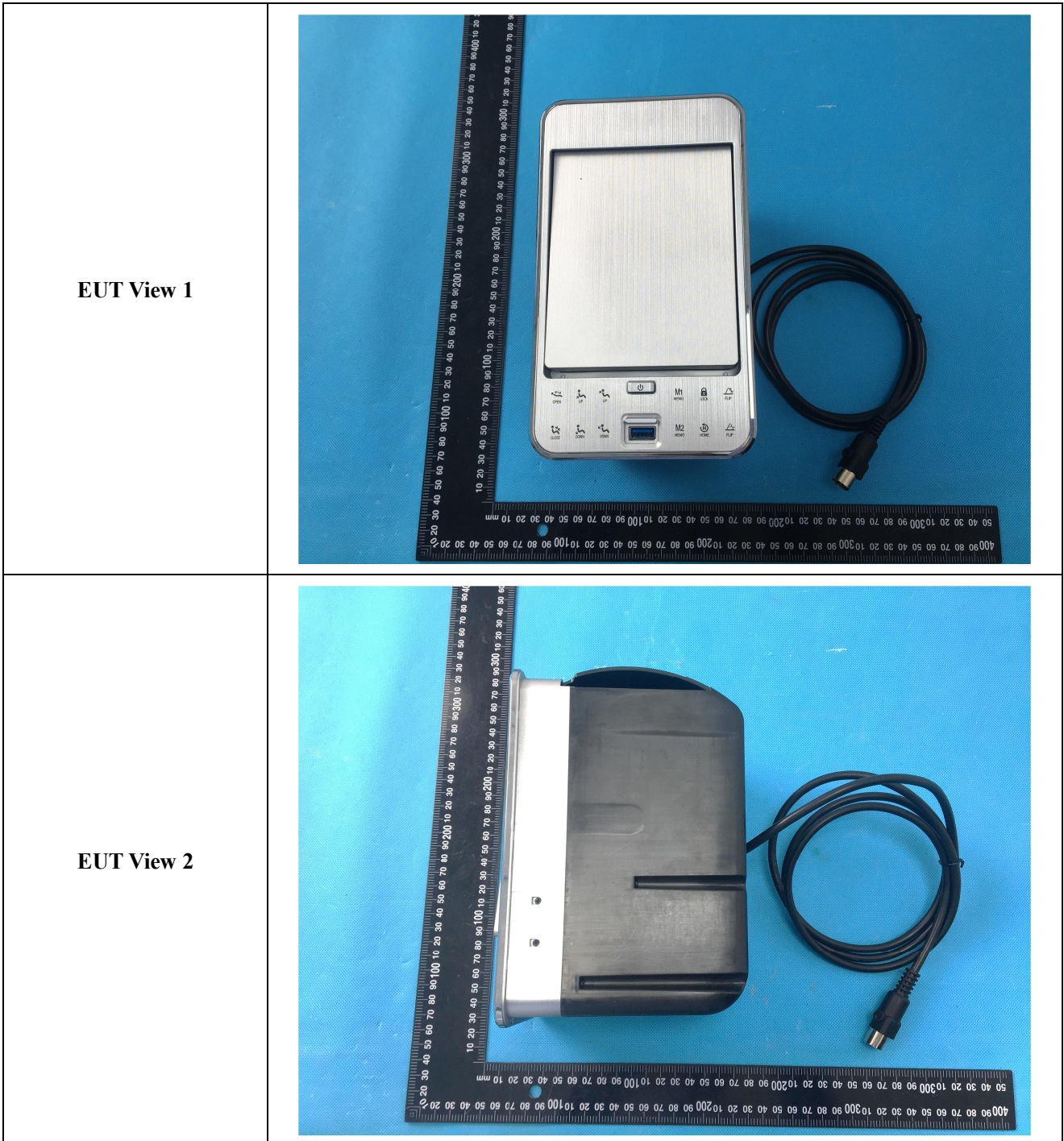
EXHIBIT 2 - EUT EXTERNAL PHOTOGRAPHS