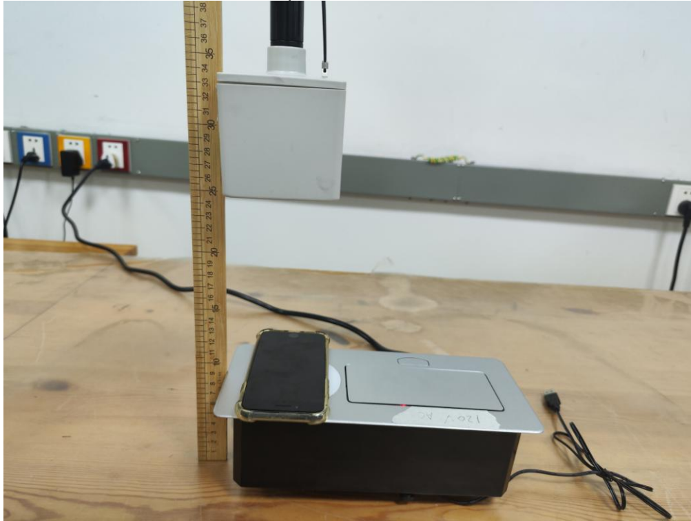
Top Position E