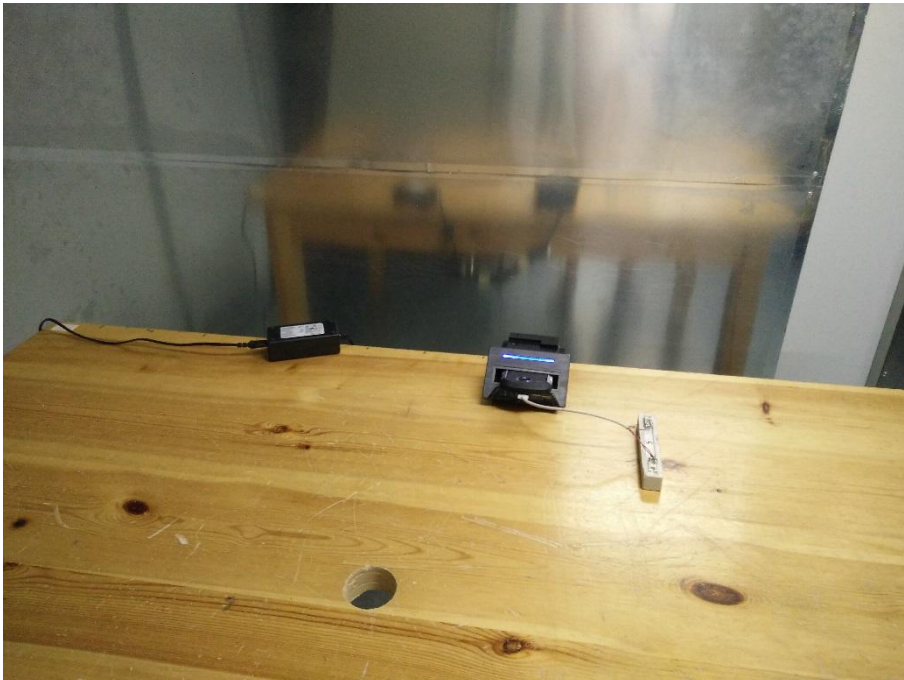
Conducted Emission Test 1