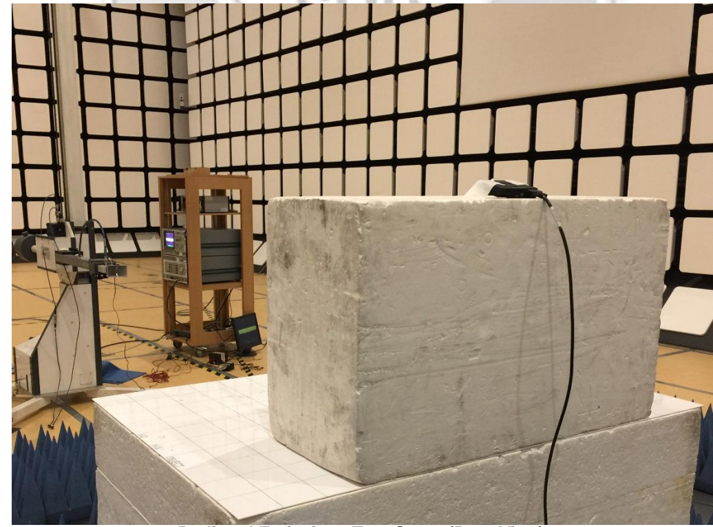
Radiated Emissions Test Setup (Rear View)