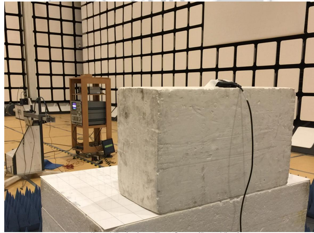
Radiated Emissions Test Setup (Rear View)