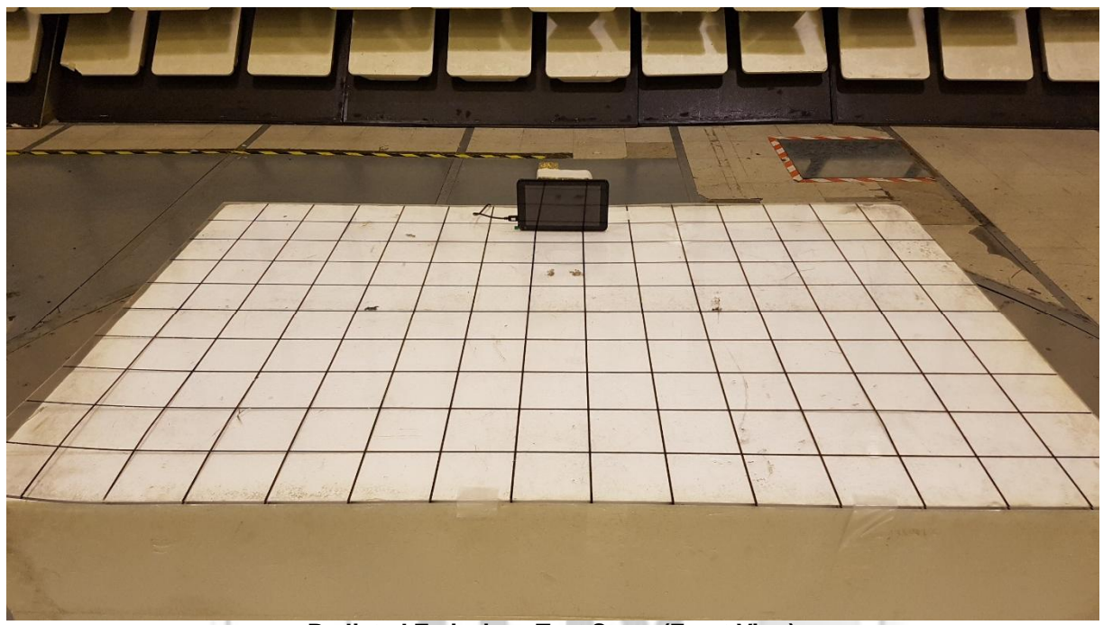
Radiated Emissions Test Setup (Front View)