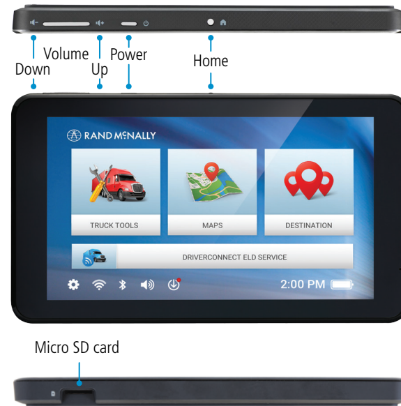
TND™ 740 Quick Start Guide