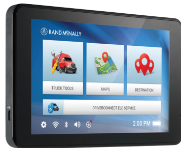
TND™ 740 Quick Start Guide