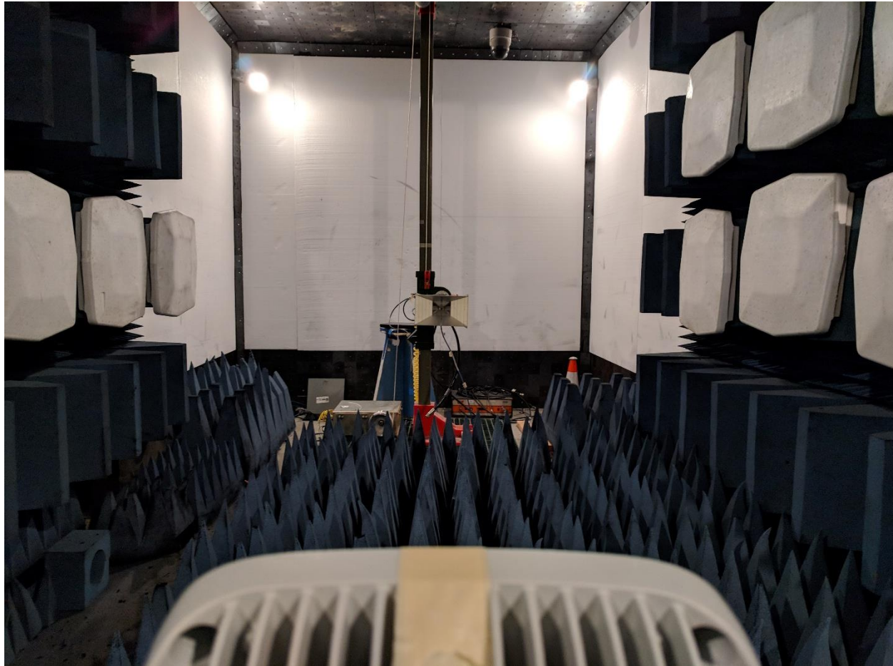
Radiated DFS Test Setup from EUT