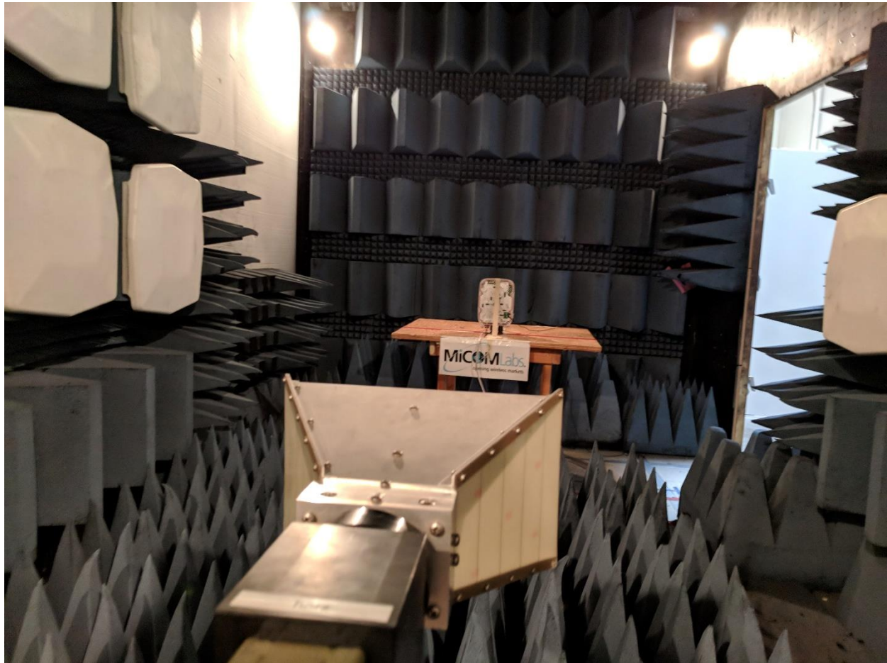
Radiated DFS Test Setup from Antenna