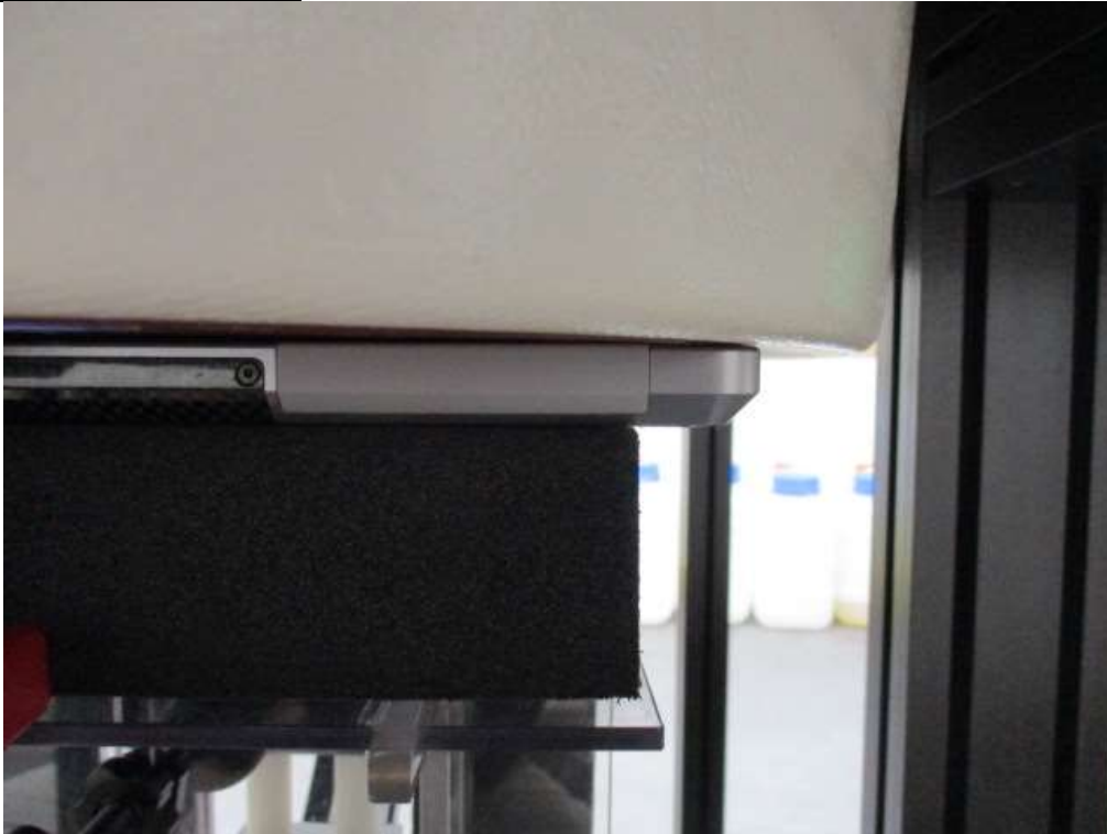
Front Side from Flat Phantom (Separation Distance: 0 cm)_Ant.1