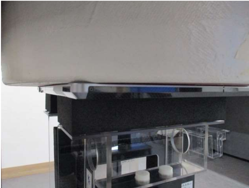
Front Side from Flat Phantom (Separation Distance: 0 cm)_Ant.1+2 (MIMO)