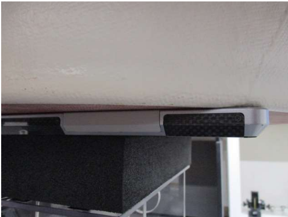
Front Side from Flat Phantom (Separation Distance: 0 cm)_Ant.2

This report shall not be reproduced except in full, without the written approval of KES Co., Ltd. The results shown in this test report refer only to the sample(s) tested unless otherwise stated. The authenticity of the test report, contact shchoi@kes.co.kr