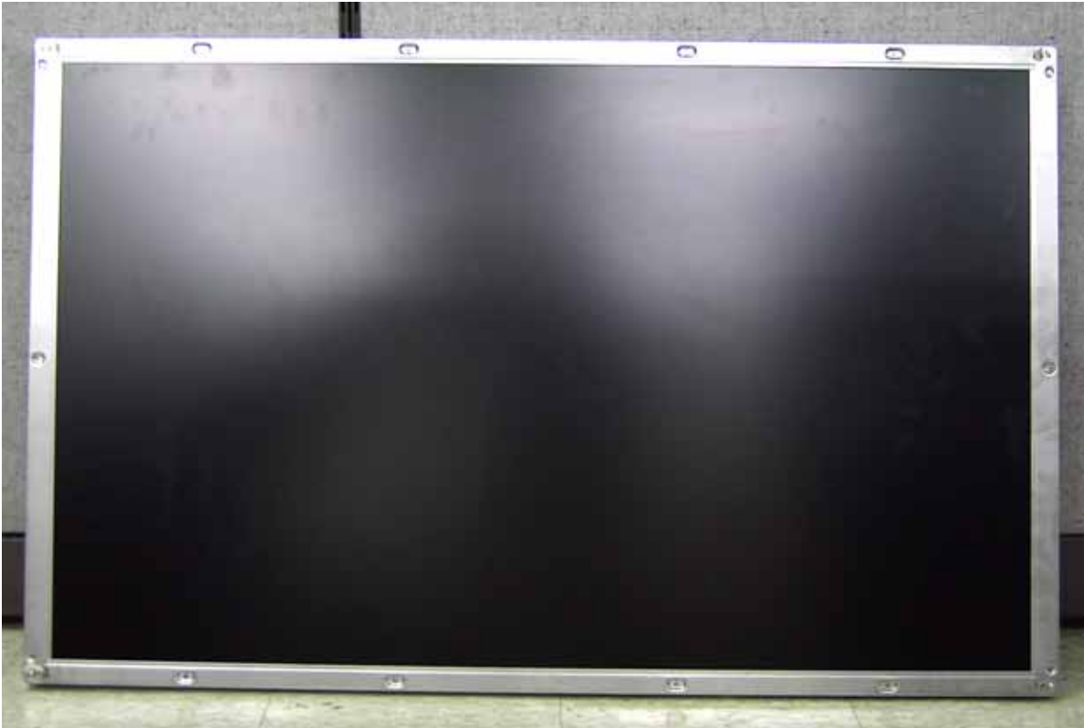
Panel front view