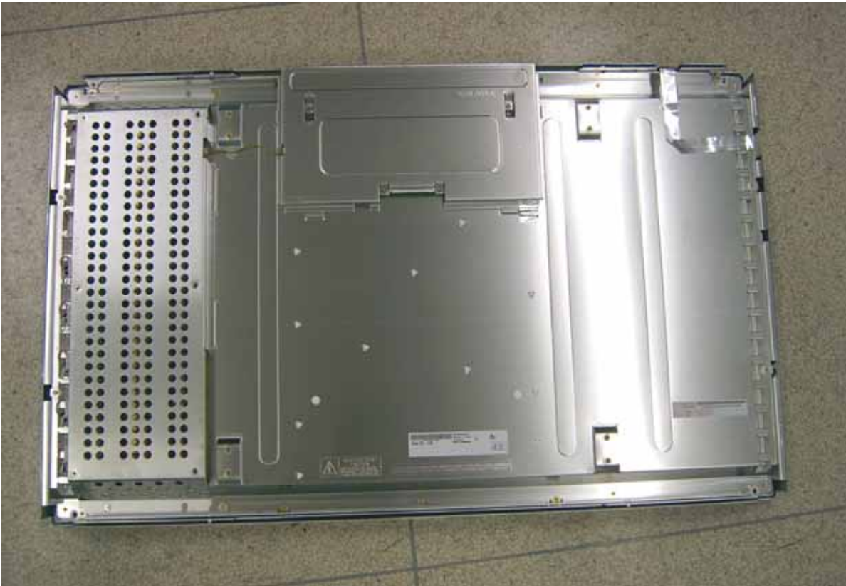
Panel rear view