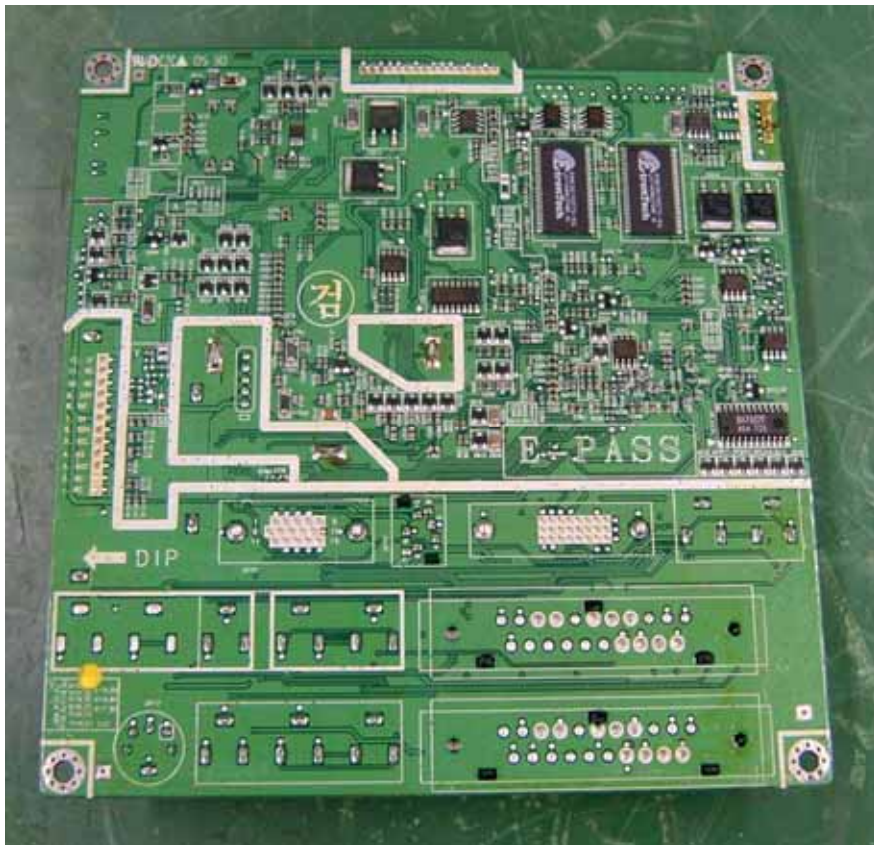
Visual board bottom view