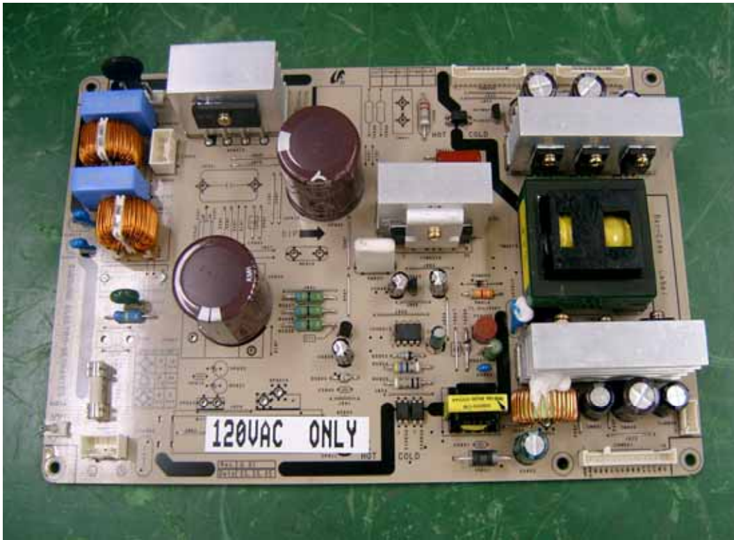
SMPS board top view