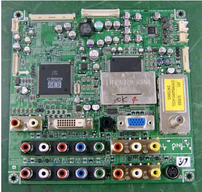
Visual board top view