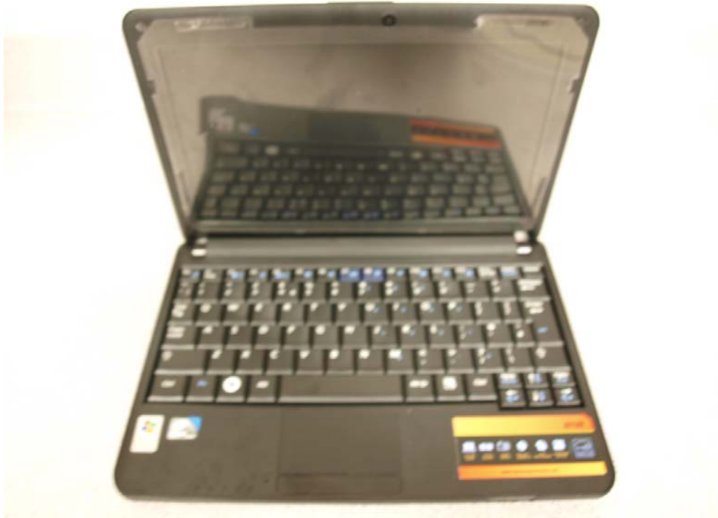
HOST DEVICE PHOTO (NP-N130)