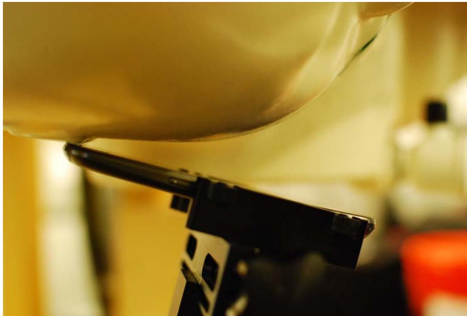
SAR Test Setup Photo 2: Right Tilt