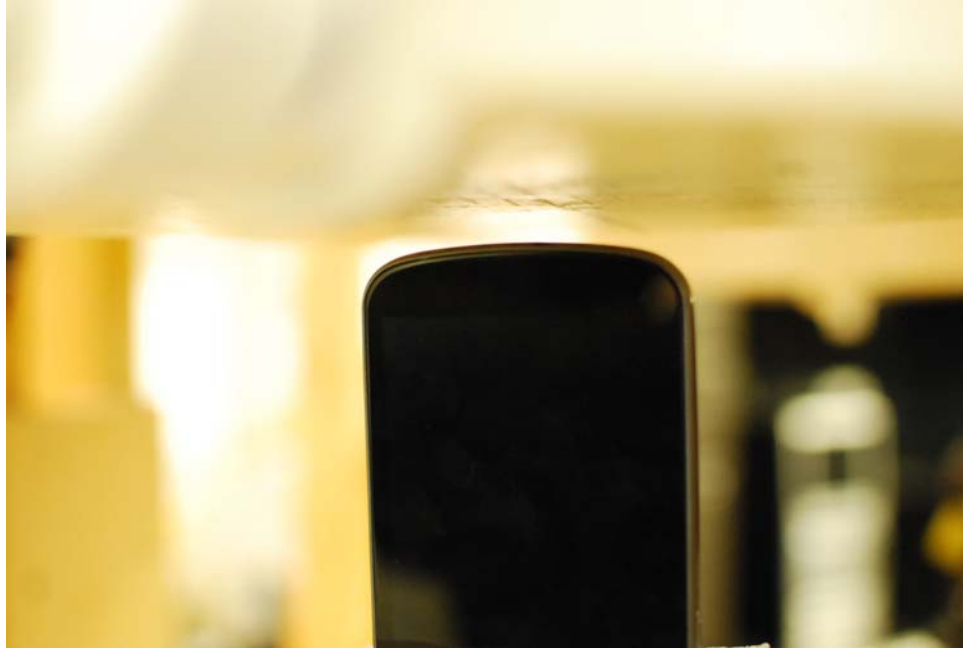
SAR Test Setup Photo 7: Bottom at 1.0 cm