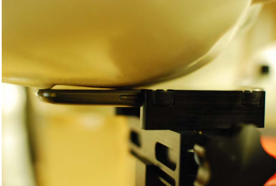
SAR Test Setup Photo 1: Right Touch