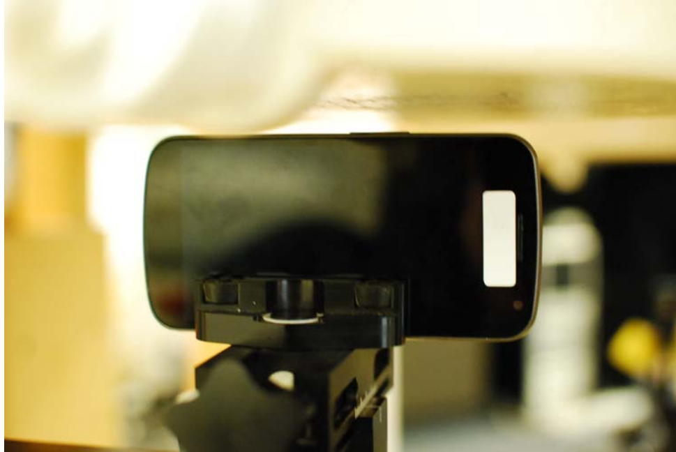
SAR Test Setup Photo 9: Left at 1.0 cm