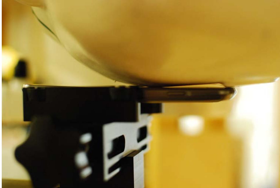
SAR Test Setup Photo 3: Left Touch