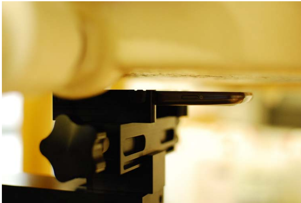
SAR Test Setup Photo 6: Front at 1.0 cm