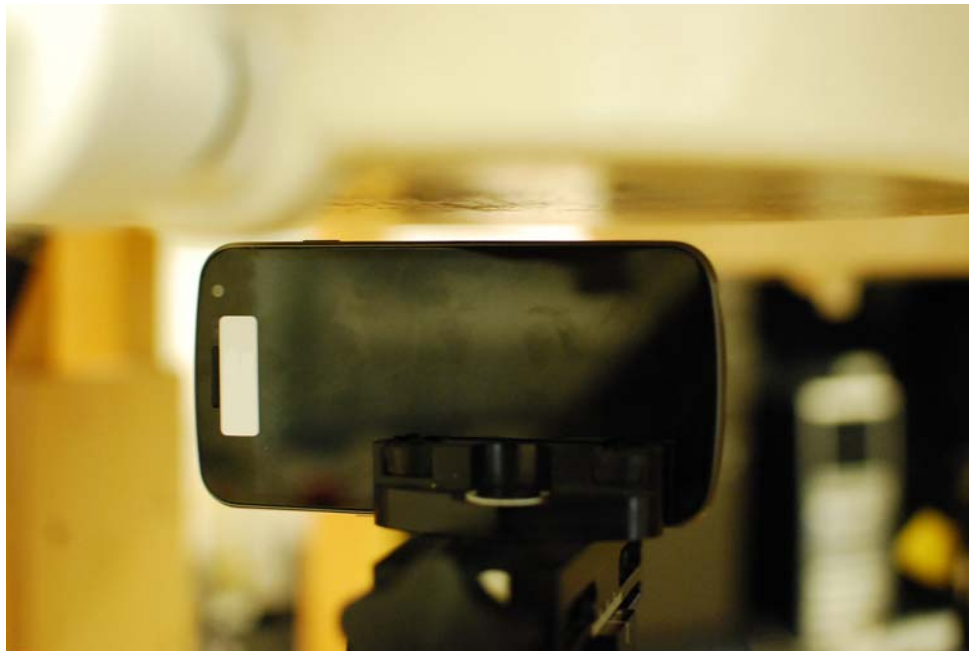
SAR Test Setup Photo 8: Right at 1.0 cm