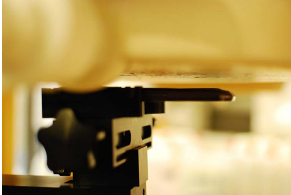
SAR Test Setup Photo 5: Back at 1.0 cm