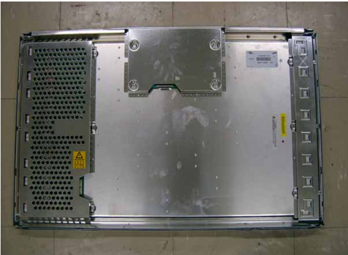
Panel rear view