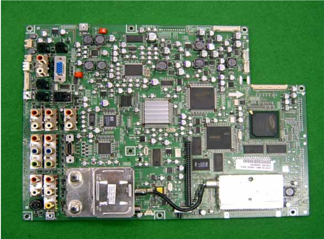
Visual board top view