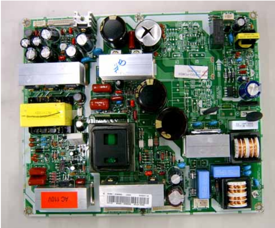
SMPS board top view