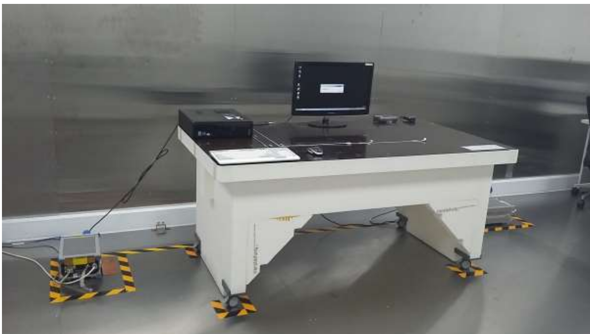
[ Conducted Disturbance – Front ]