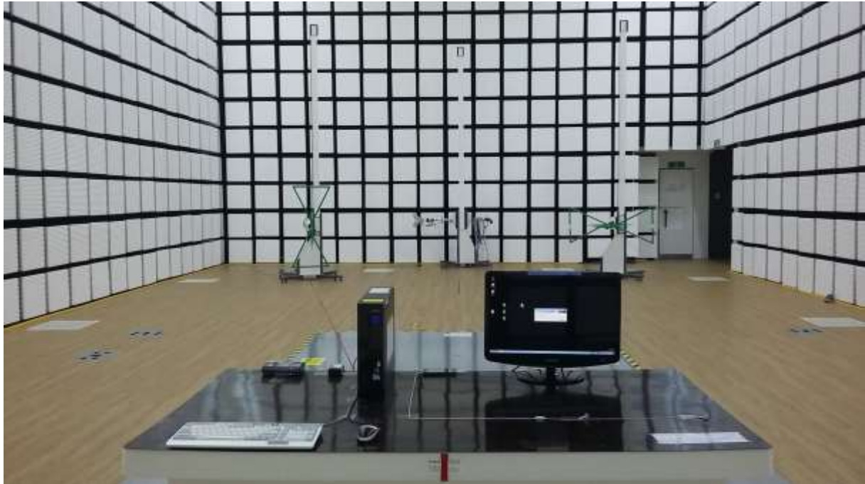
[ Radiated Disturbance for Below 1 GHz – Front ]