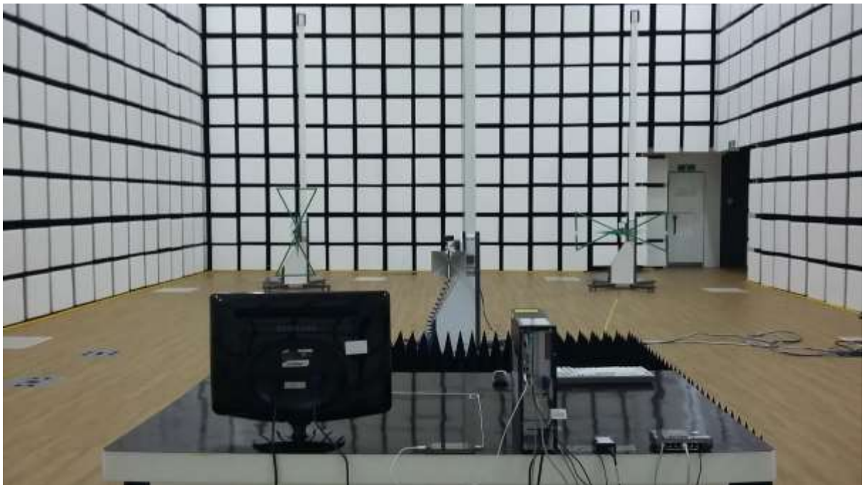
[ Radiated Disturbance for Above 1 GHz – Rear ]