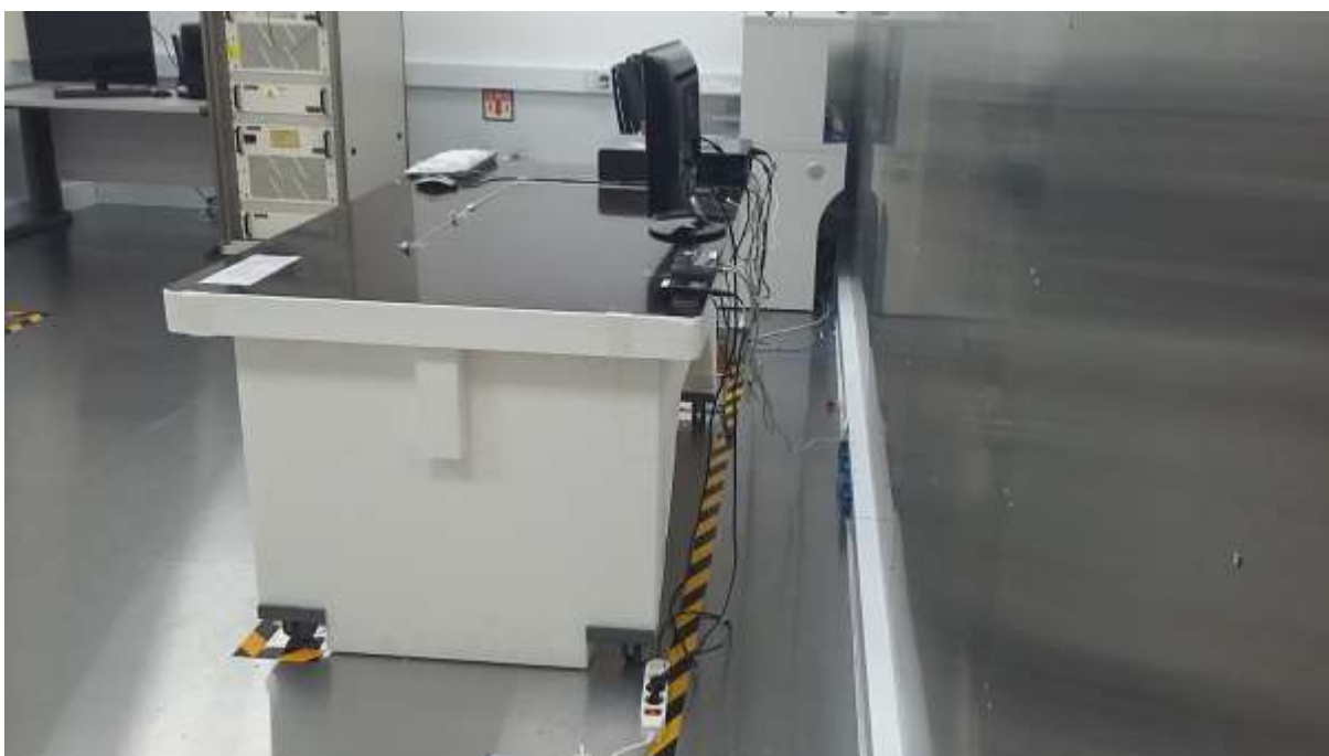
[ Conducted Disturbance – Rear ]