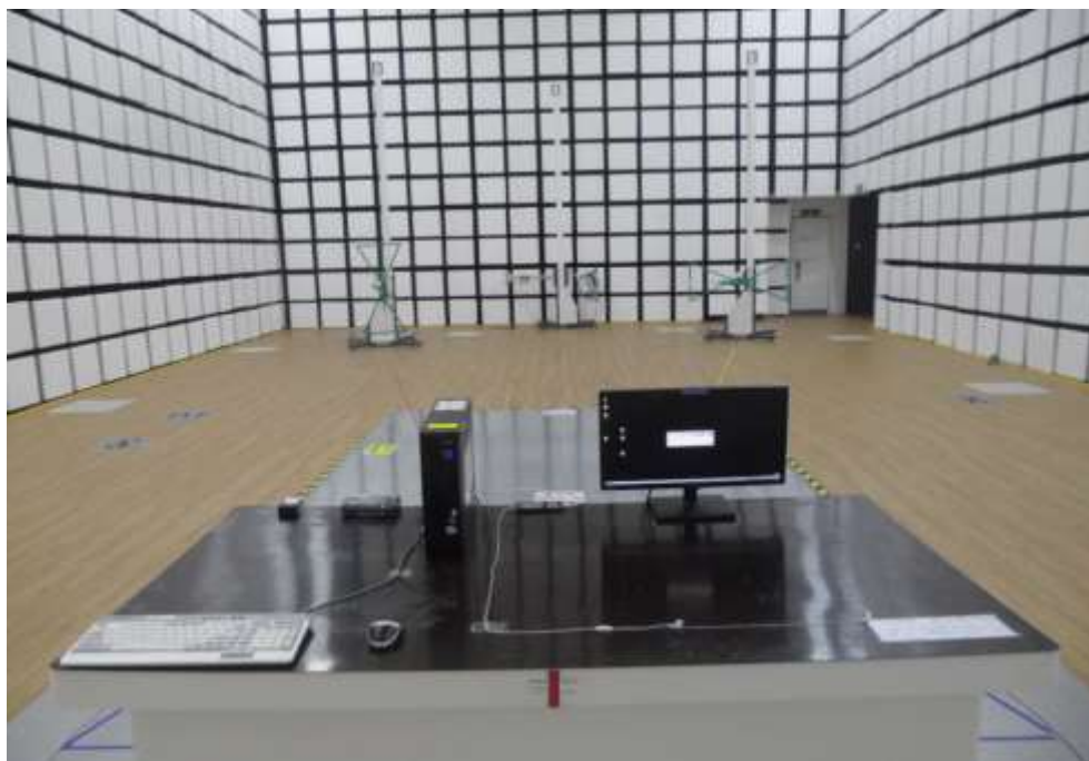
[ Radiated Disturbance for Below 1 GHz – Front ]