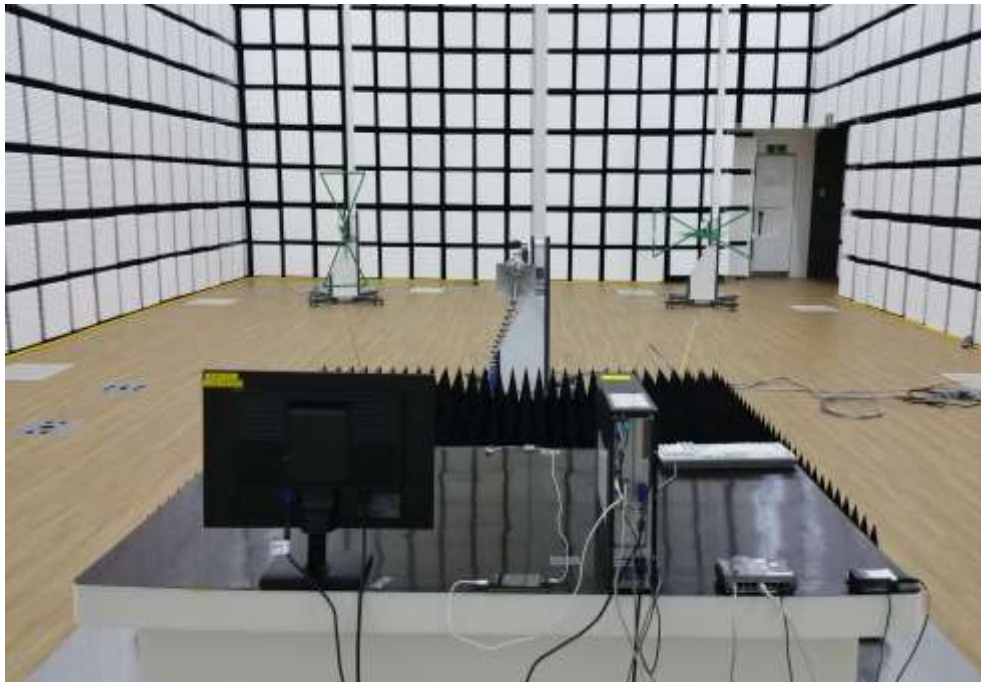
[ Radiated Disturbance for Above 1 GHz – Rear ]