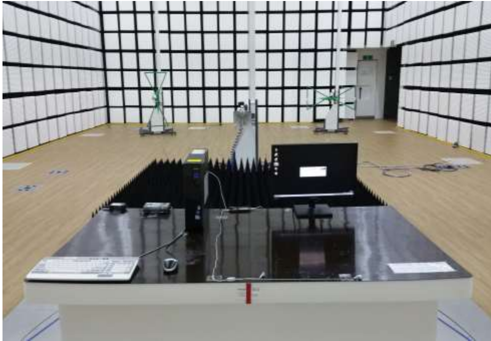
[ Radiated Disturbance for Above 1 GHz – Front ]