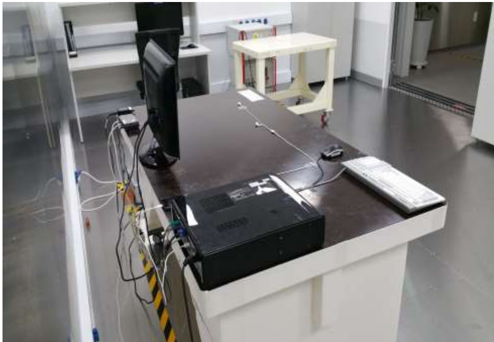
[ Conducted Disturbance – Rear ]