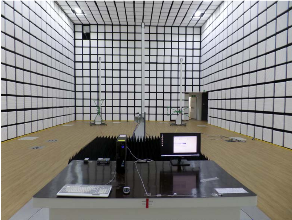
[ Radiated Disturbance for Above 1 GHz – Front ]