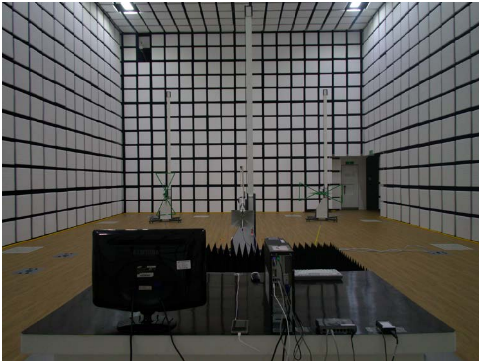
[ Radiated Disturbance for Above 1 GHz – Rear ]