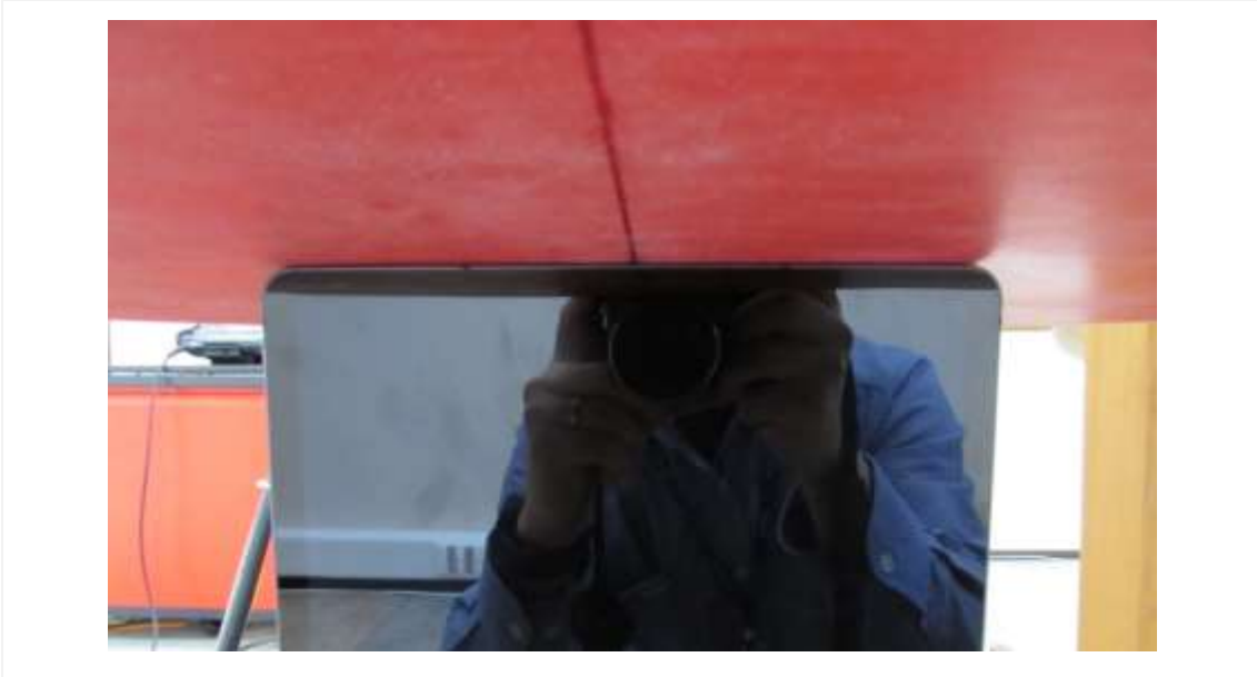
Distance of 0 mm from the EUT