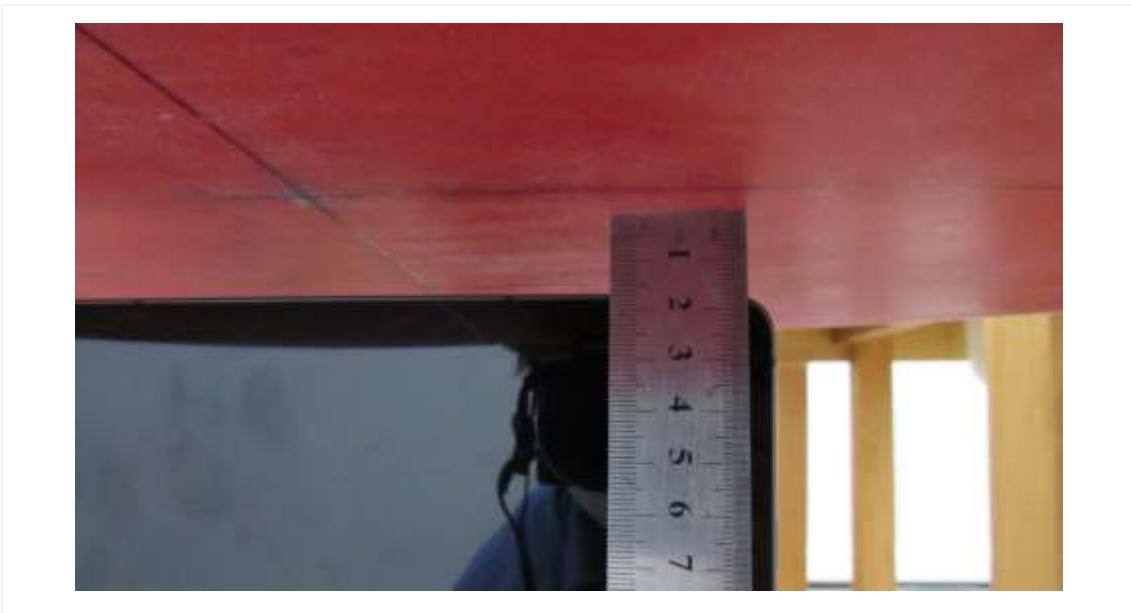
Distance of 17 mm from the EUT