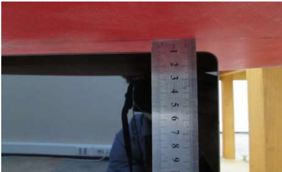
Distance of 9 mm from the EUT