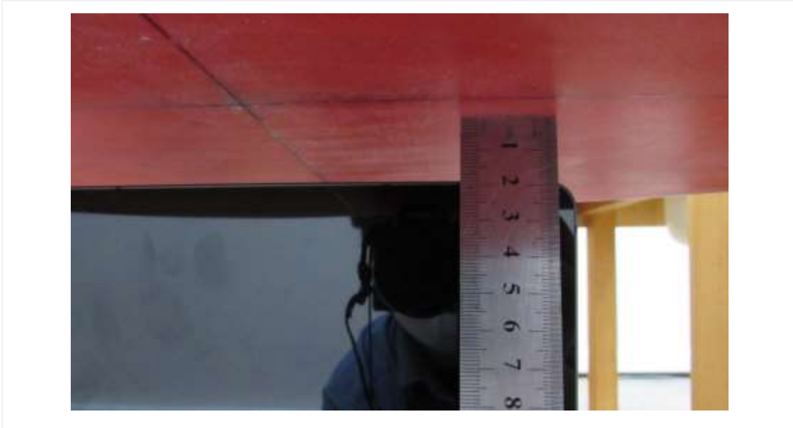
Distance of 19 mm from the EUT