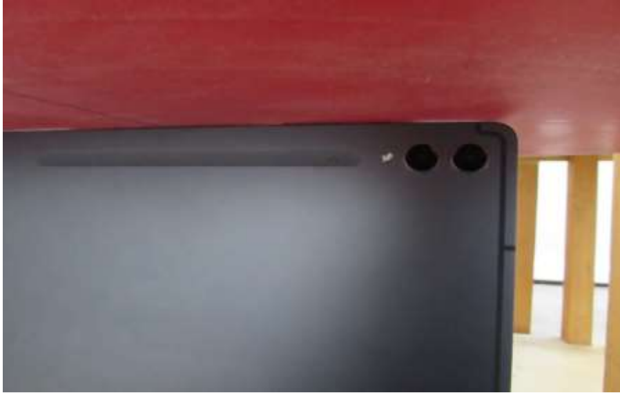
Distance of 0 mm from the EUT