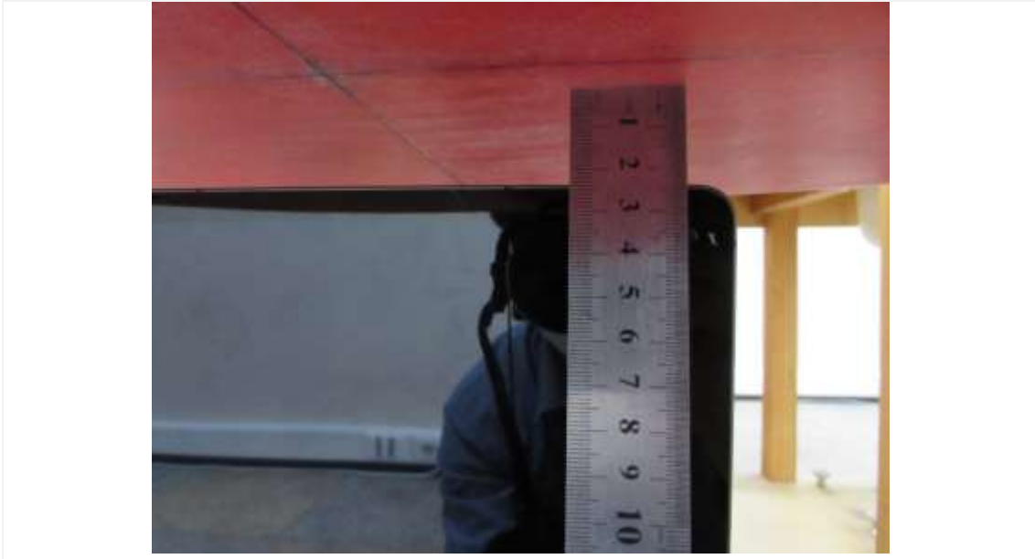
Distance of 24 mm from the EUT