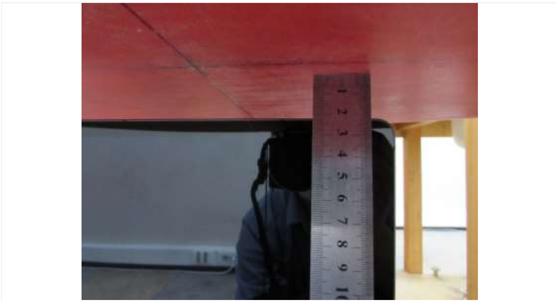
Distance of 22 mm from the EUT