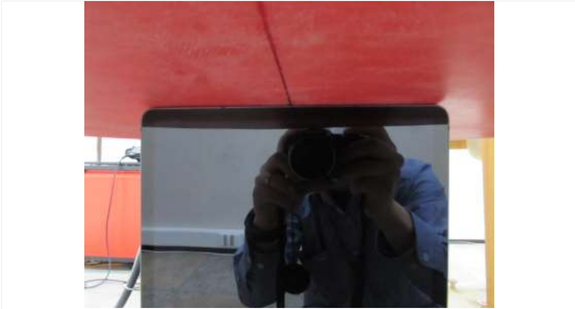
Distance of 0 mm from the EUT