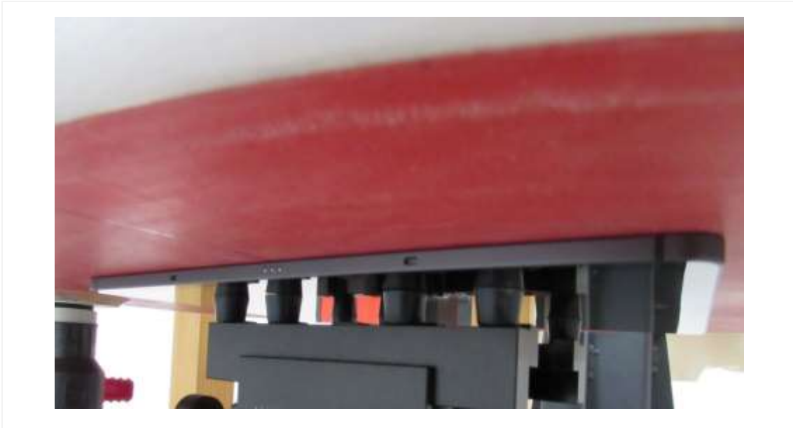
Distance of 0 mm from the EUT