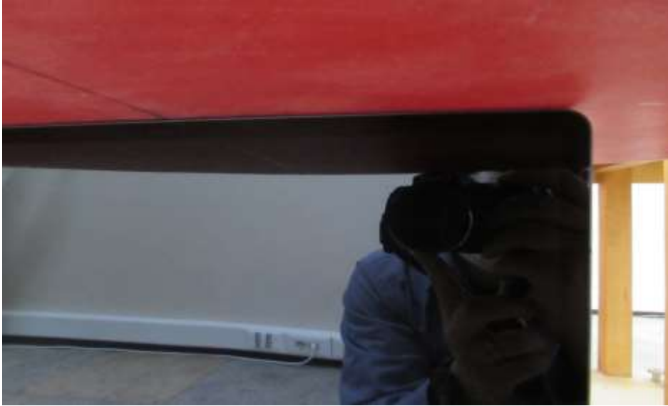
Distance of 0 mm from the EUT