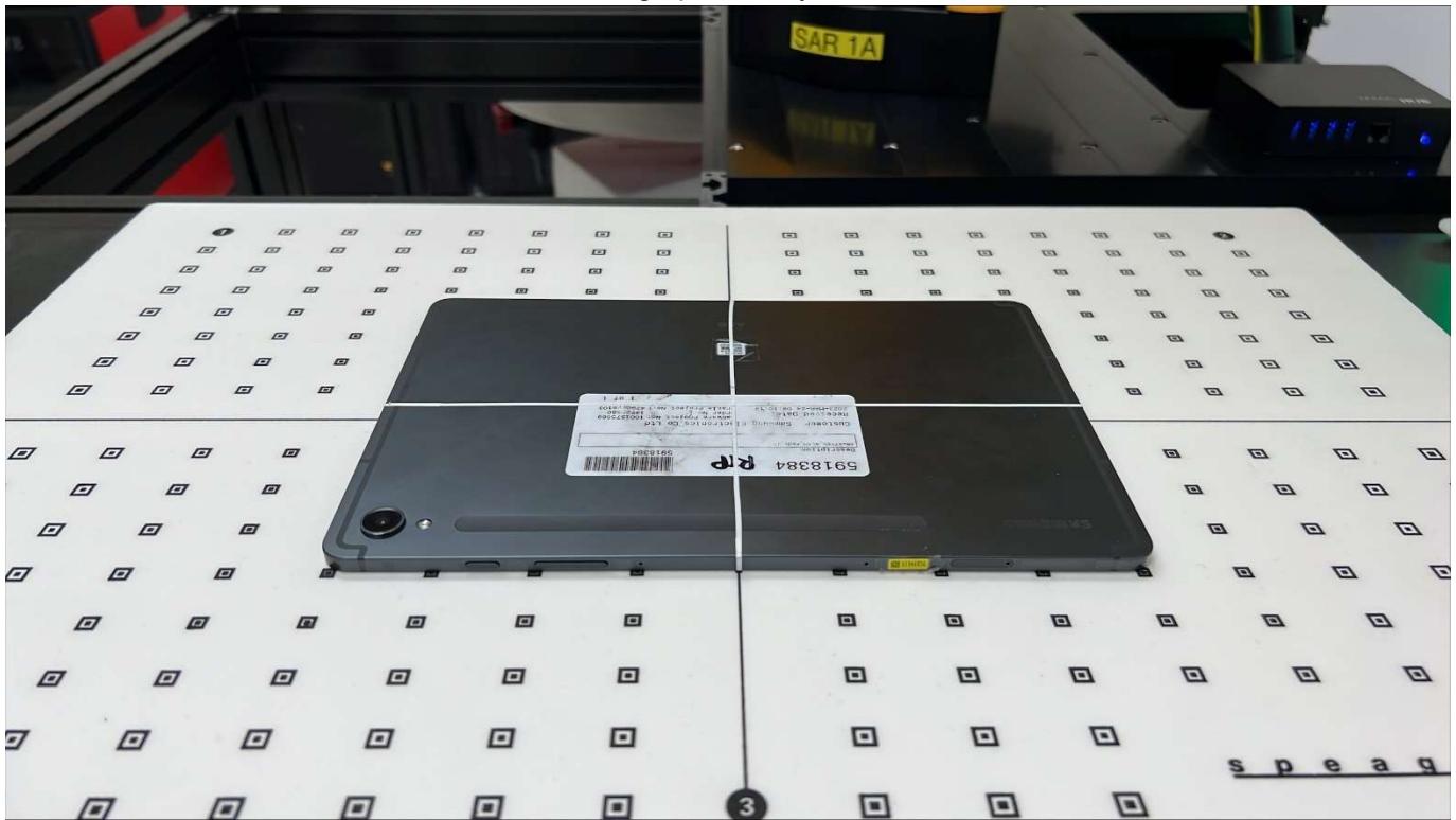
Photograph 5: Body, Back