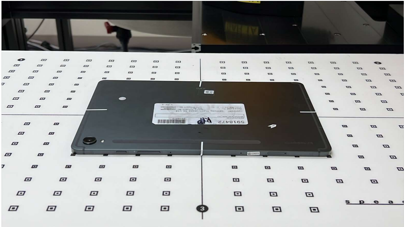
Photograph 5: Body, Back