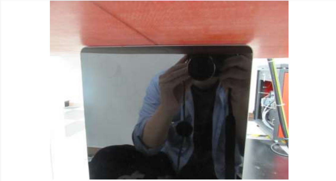
Distance of 0 mm from the EUT