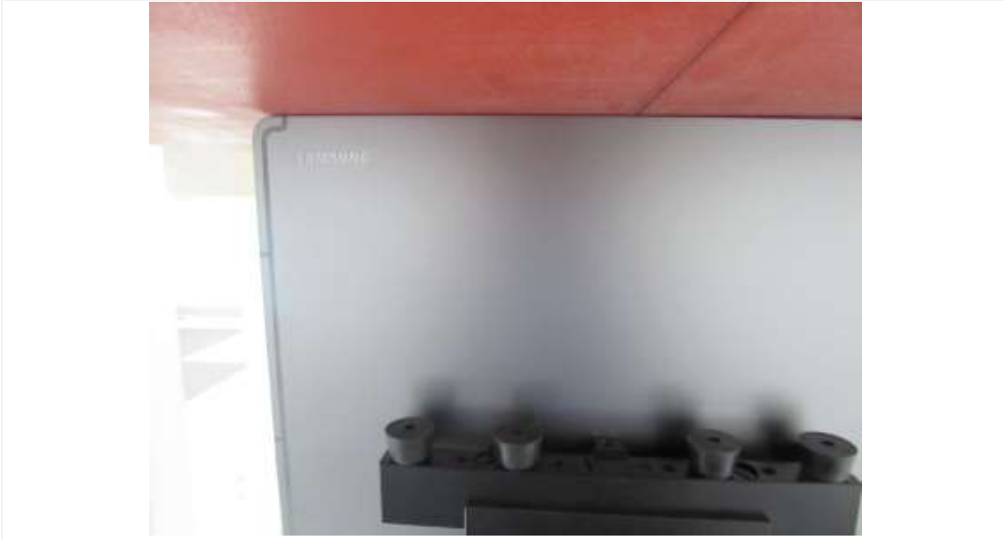
Distance of 0 mm from the EUT