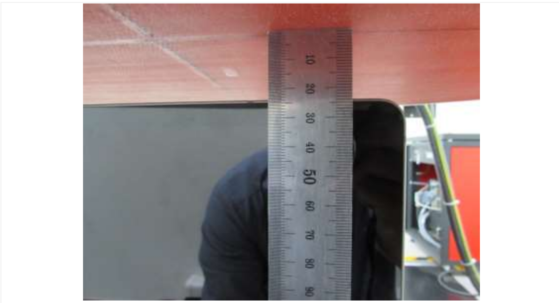
Distance of 24 mm from the EUT