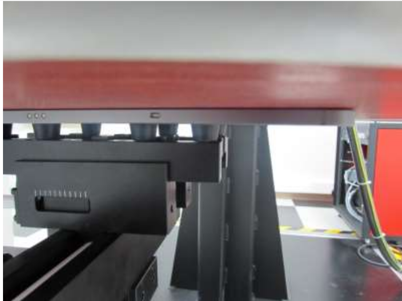
Distance of 0 mm from the EUT