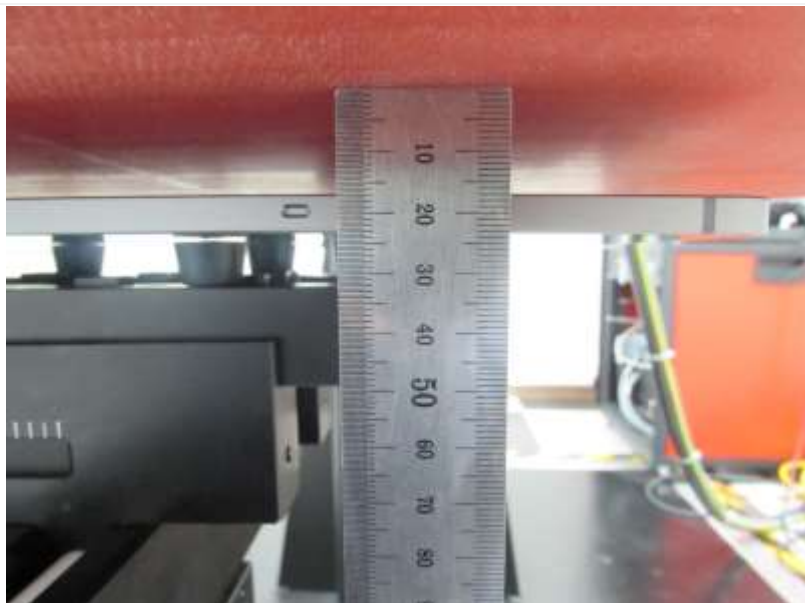
Distance of 17 mm from the EUT