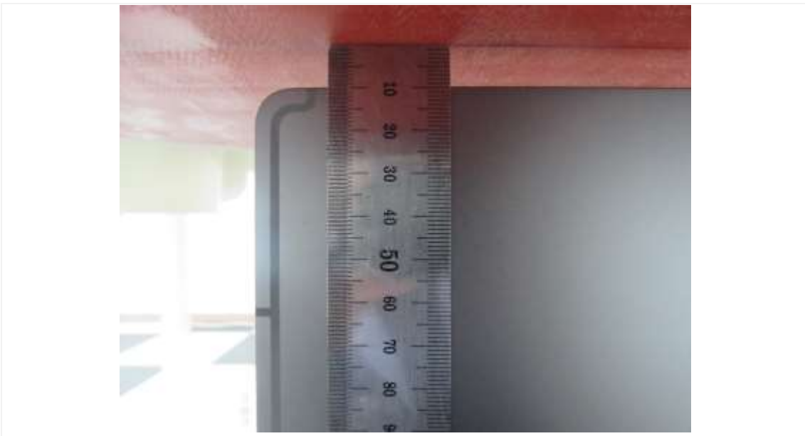
Distance of 10 mm from the EUT