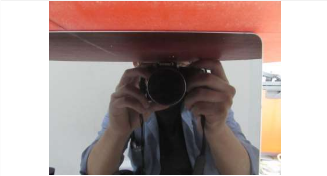
Distance of 0 mm from the EUT