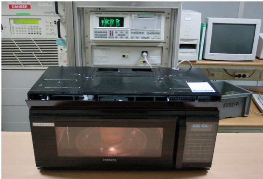
Fig.3 Test Setup for RF output power

The Caloric Method was used to determine maximum output power. The initial temperature of a 1000-ml water load was measured. The water load was placed in the center of the oven. The oven was operated at maximum output power for 120 seconds. Then the temperature of the water re-measured.