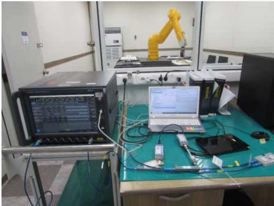
Test setup photo-4 (8-1(c) 5G Sub 6)