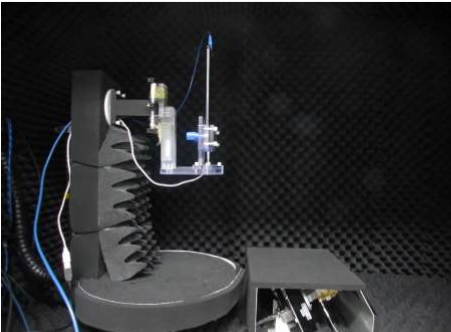
Test setup photo-2 (8-1(b) mmWave CATR)