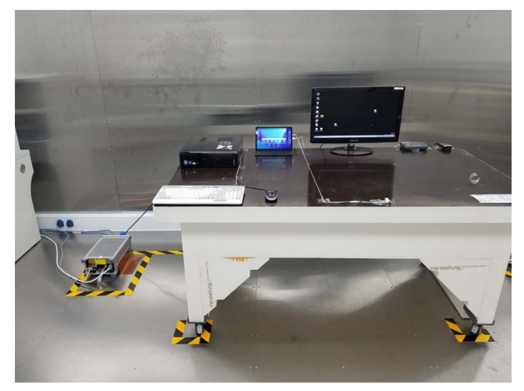
[ Conducted Disturbance – Front ]