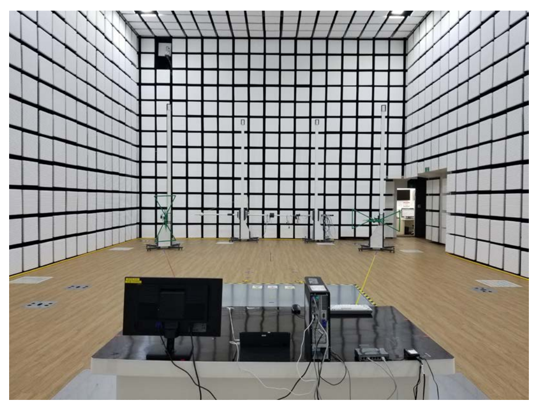
[ Radiated Disturbance for Below 1 GHz - Rear ]