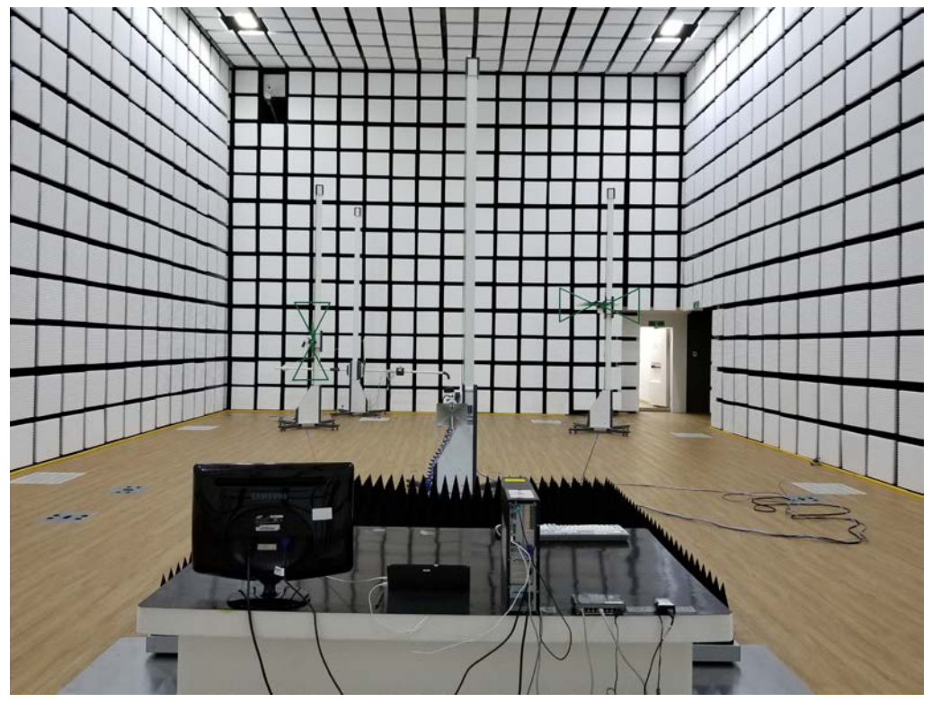
[ Radiated Disturbance for Above 1 GHz - Rear ]