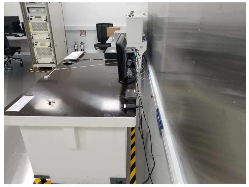
[ Conducted Disturbance – Rear ]