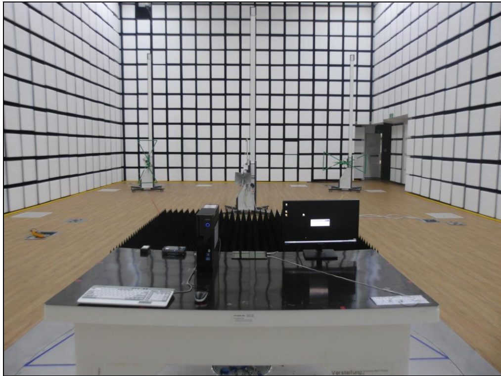
[ Radiated Disturbance for Above 1 GHz – Front ]