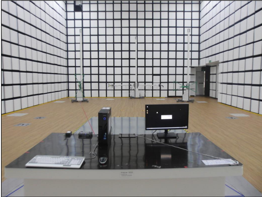
[ Radiated Disturbance for Below 1 GHz – Front ]