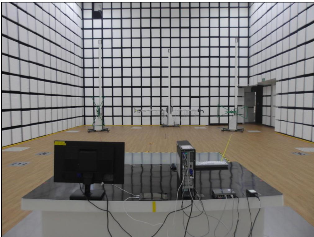
[ Radiated Disturbance for Below 1 GHz – Rear ]