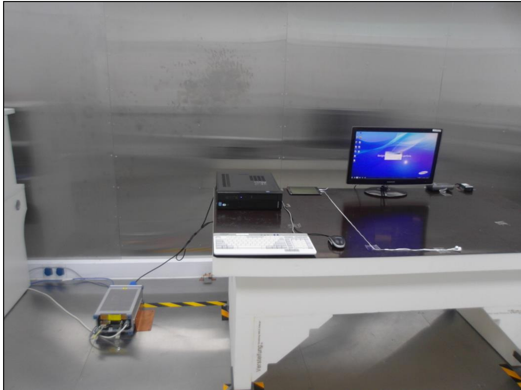
[ Conducted Disturbance – Front ]