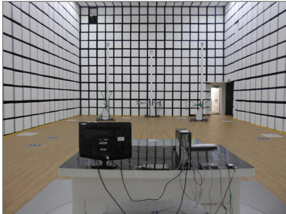
[ Radiated Disturbance for Below 1 GHz – Rear ]