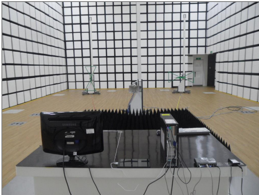
[ Radiated Disturbance for Above 1 GHz – Rear ]