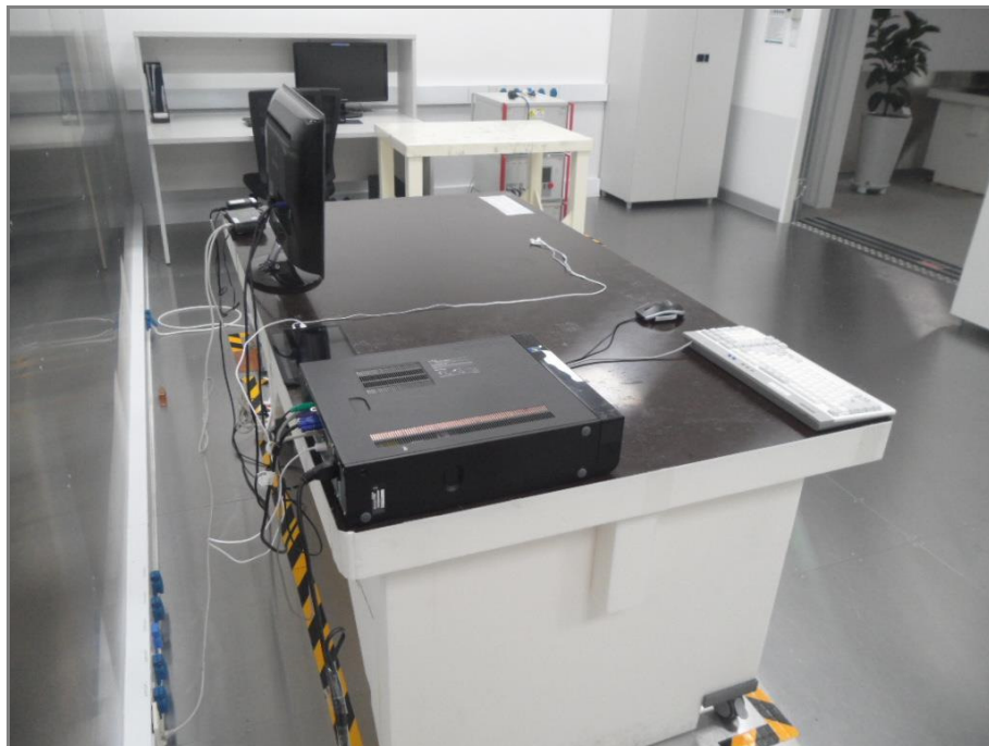
[ Conducted Disturbance – Rear ]