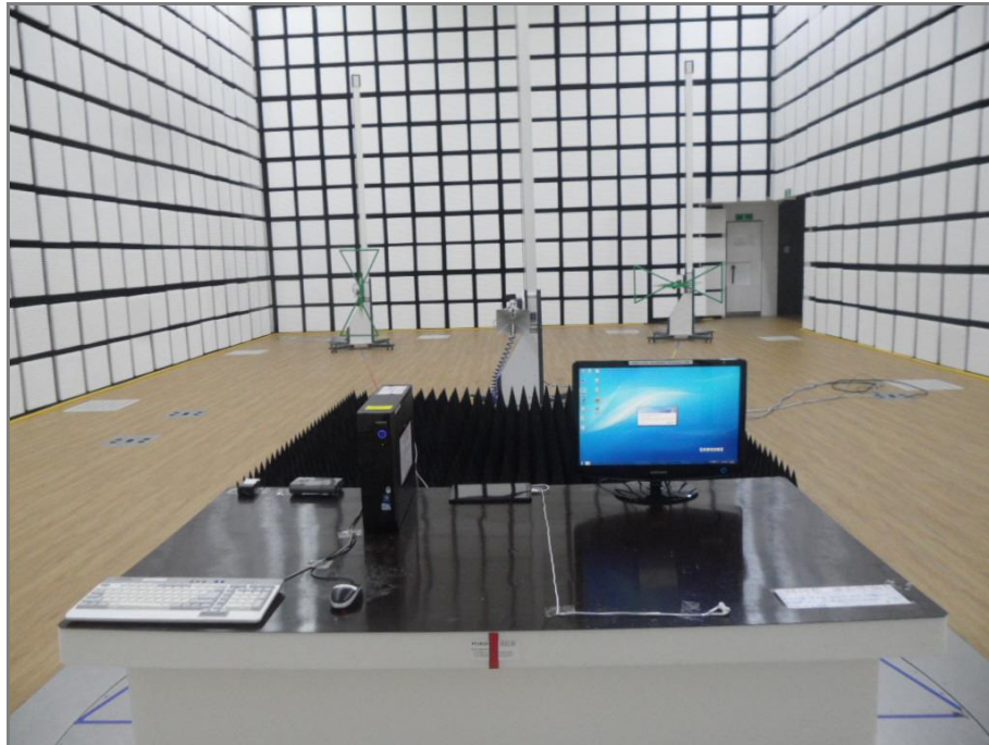
[ Radiated Disturbance for Above 1 GHz – Front ]