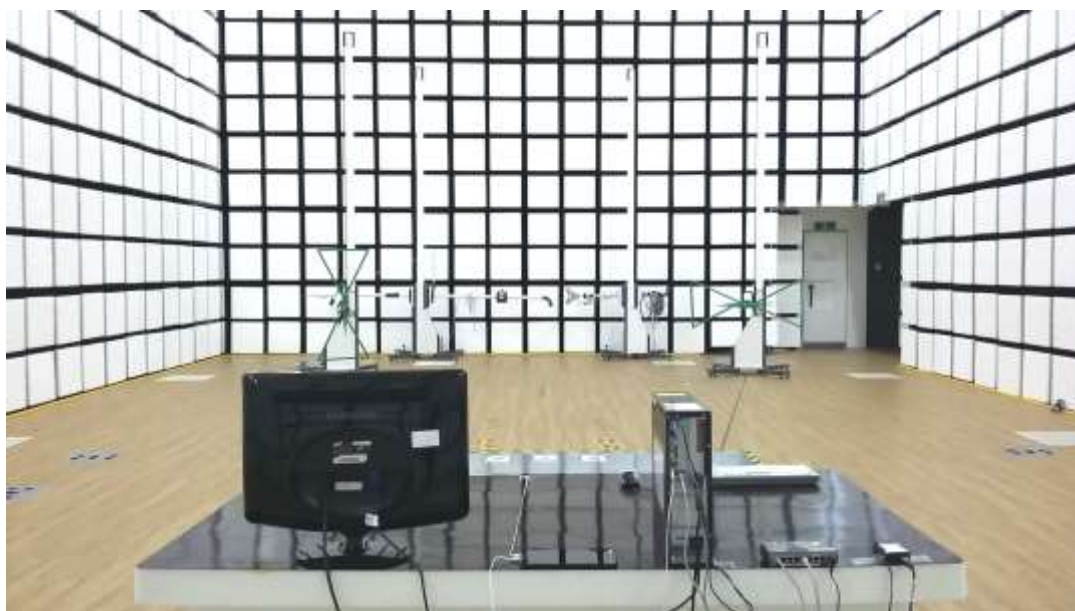
[ Radiated Disturbance for Below 1 GHz – Rear ]