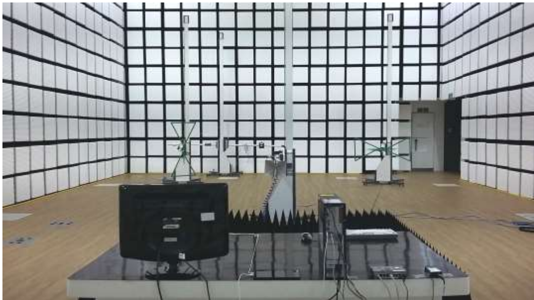
[ Radiated Disturbance for Above 1 GHz – Rear ]