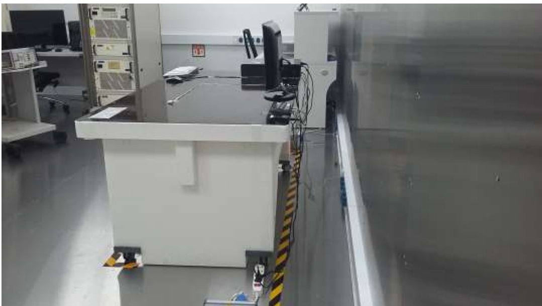
[ Conducted Disturbance – Rear ]