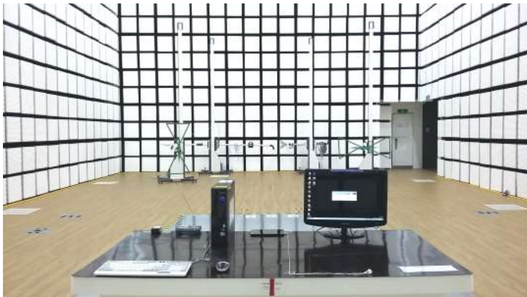
[ Radiated Disturbance for Below 1 GHz – Front ]