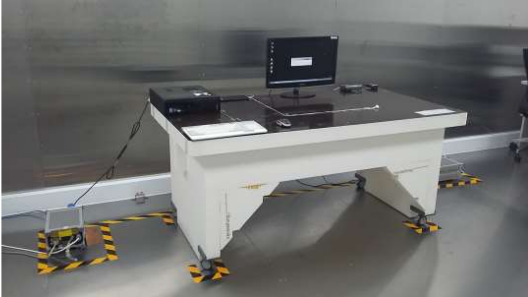
[ Conducted Disturbance – Front ]