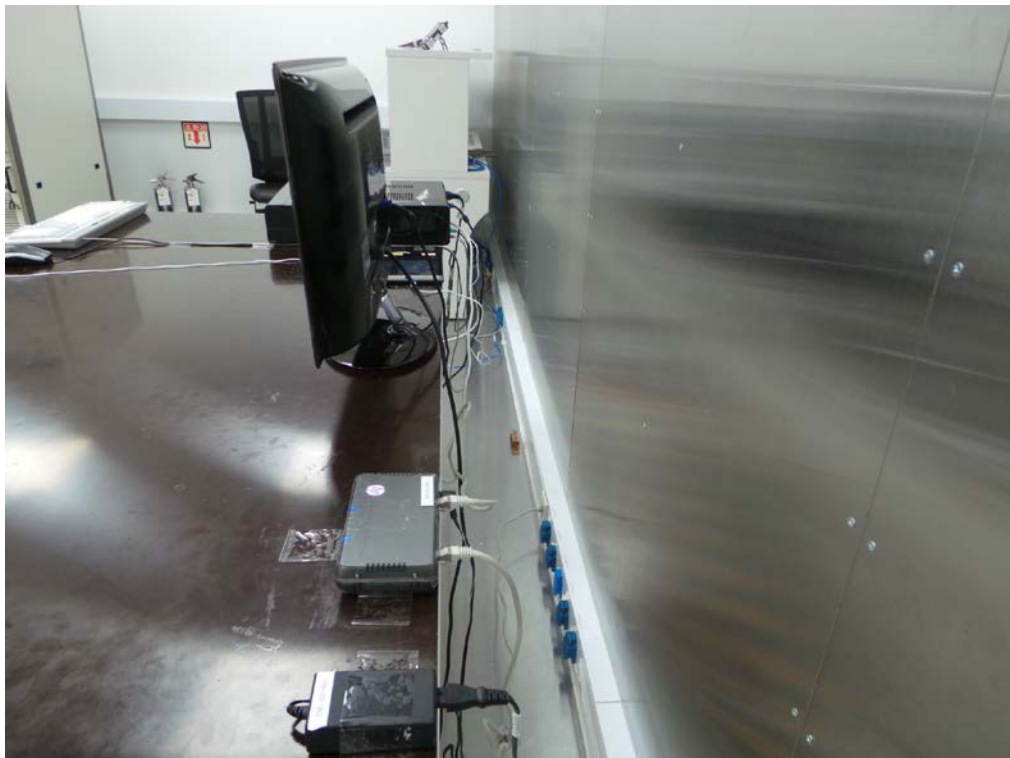
[ Conducted Disturbance – Rear ]