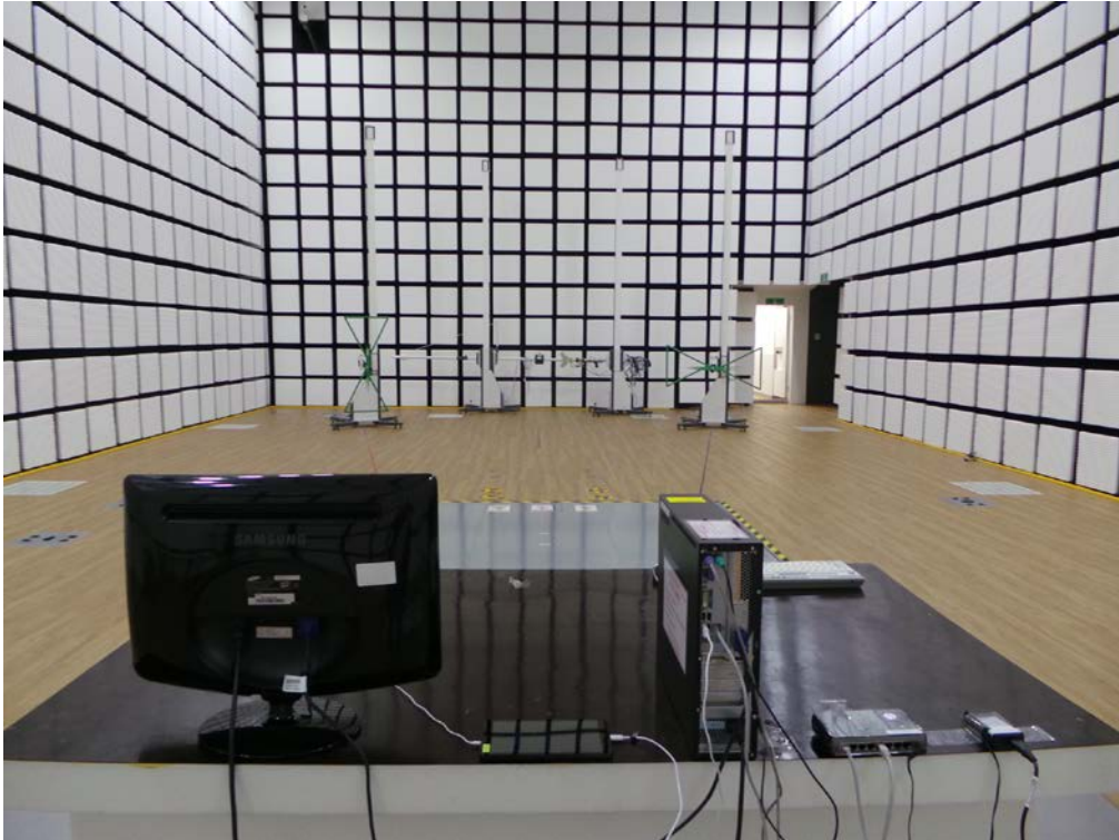
[ Radiated Disturbance for Below 1 GHz – Rear ]