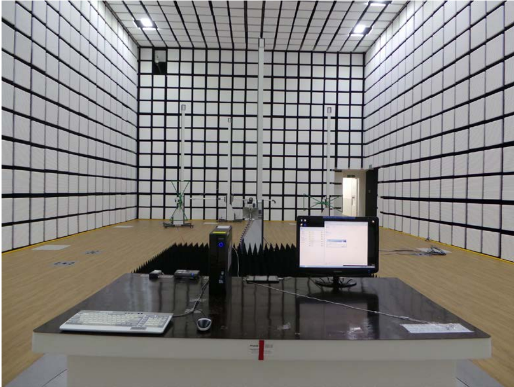
[ Radiated Disturbance for Above 1 GHz – Front ]