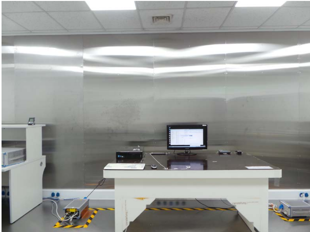
[ Conducted Disturbance – Front ]