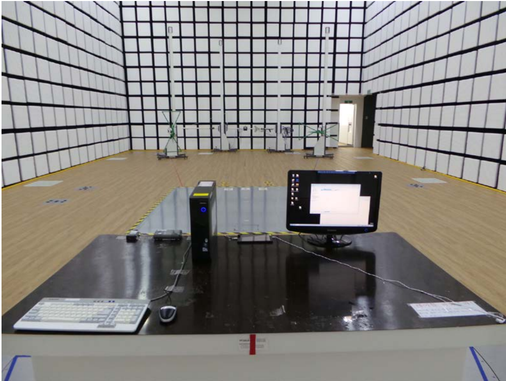
[ Radiated Disturbance for Below 1 GHz – Front ]