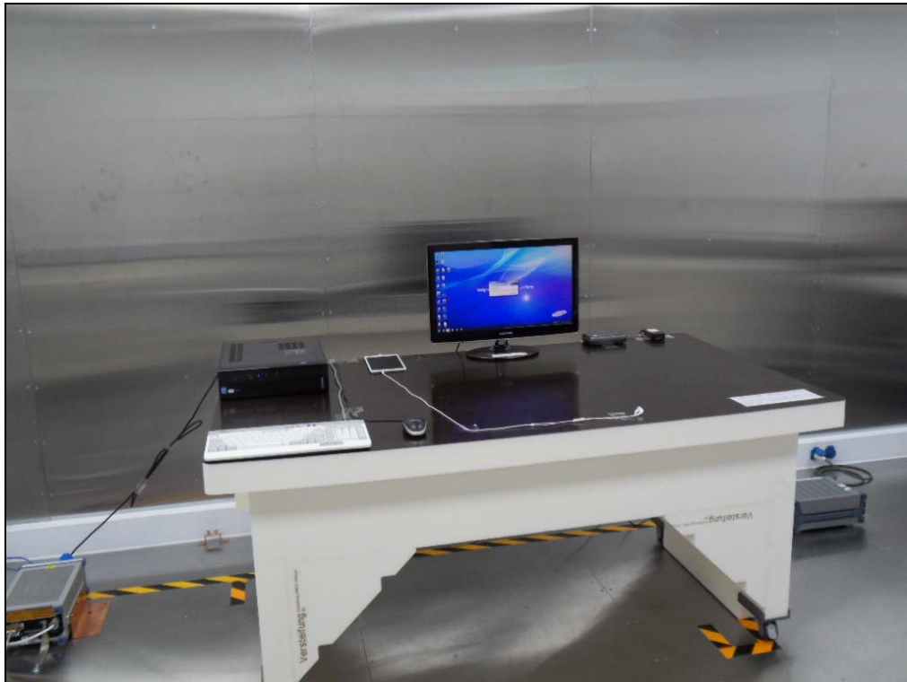
[ Conducted Disturbance – Front ]