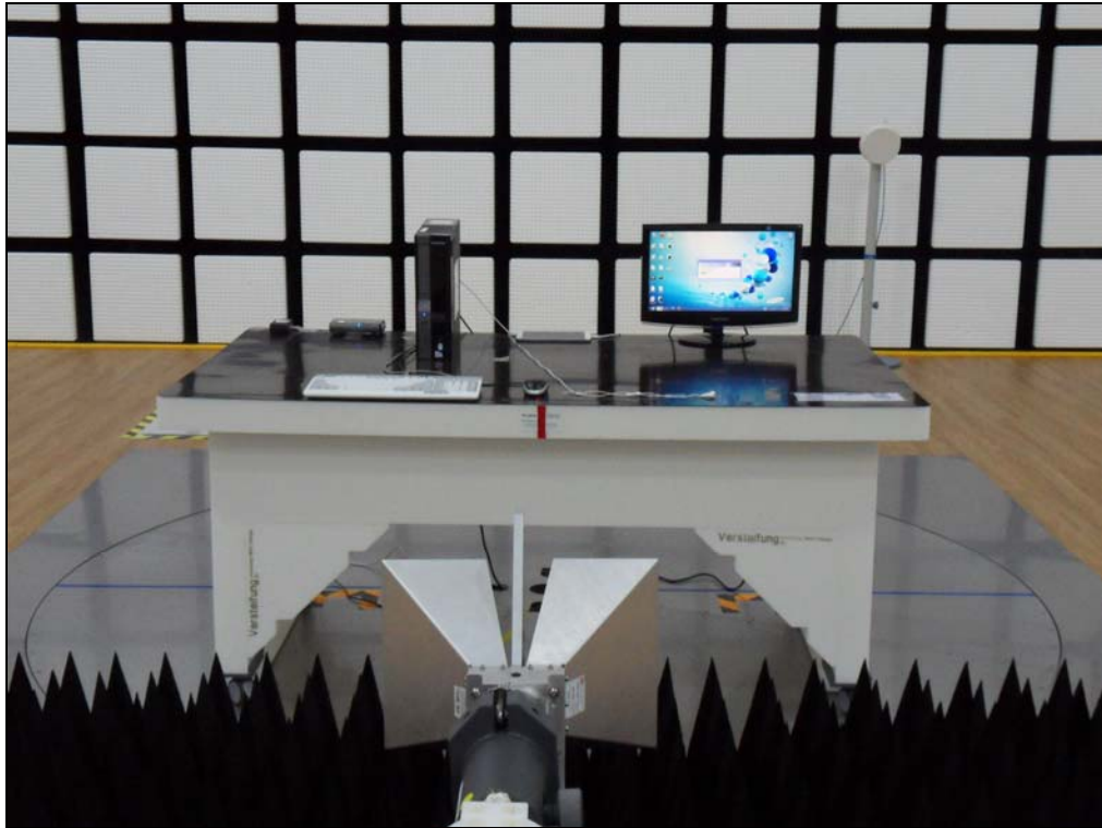
[ Radiated Disturbance for Above 1 GHz – Front ]