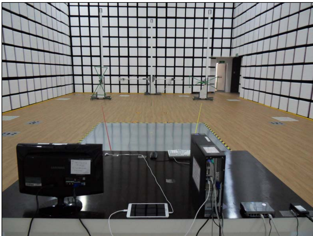
[ Radiated Disturbance for Below 1 GHz – Rear ]