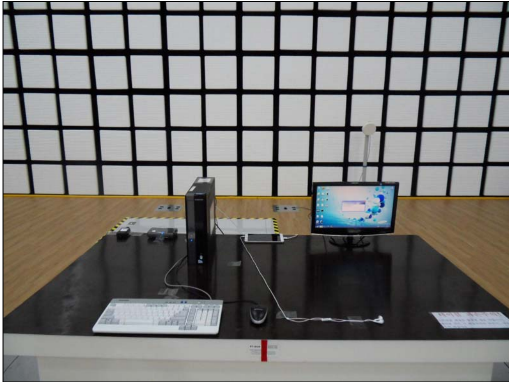
[ Radiated Disturbance for Below 1 GHz – Front ]