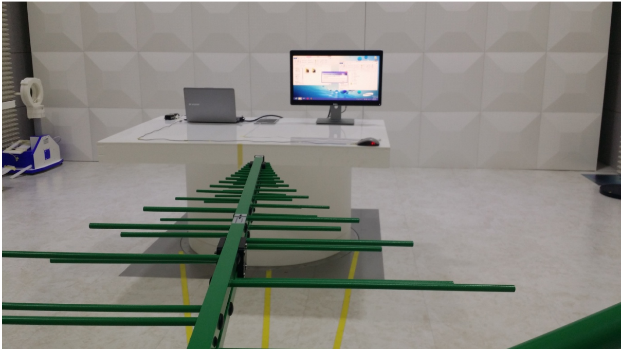
[Radiated Disturbance for Below 1 GHz – Front]