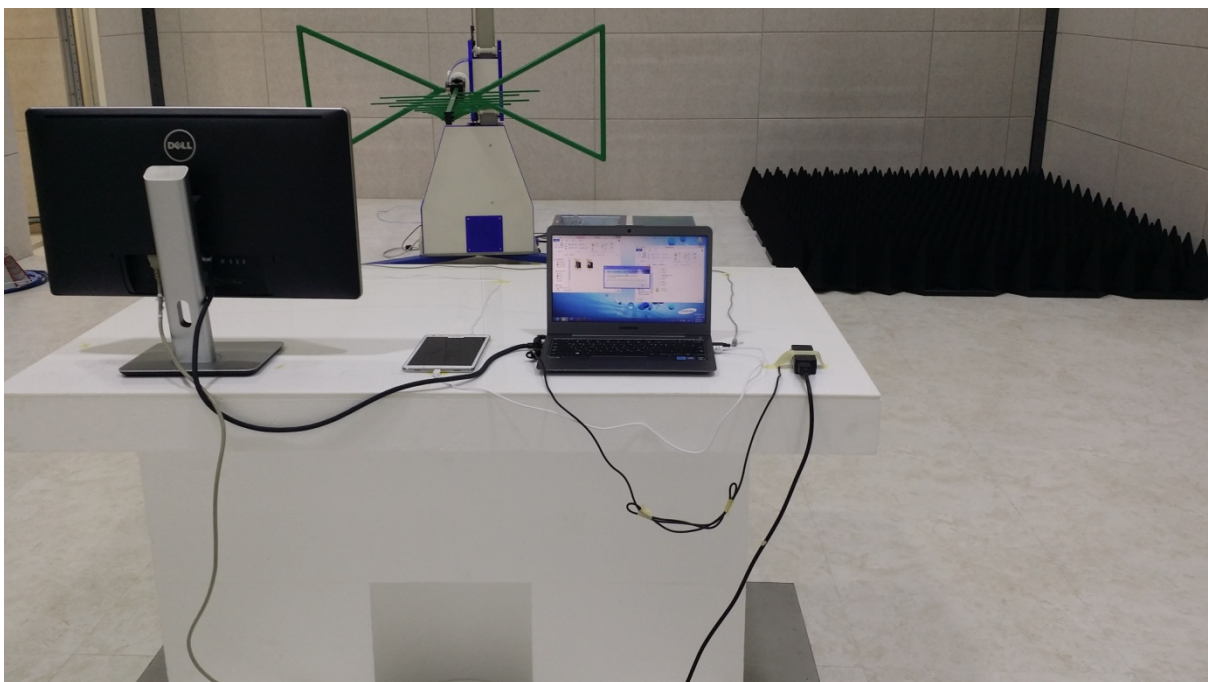
[Radiated Disturbance for Below 1 GHz – Rear]