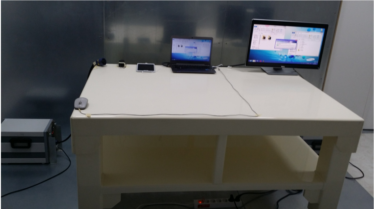
[Conducted Disturbance – Front]