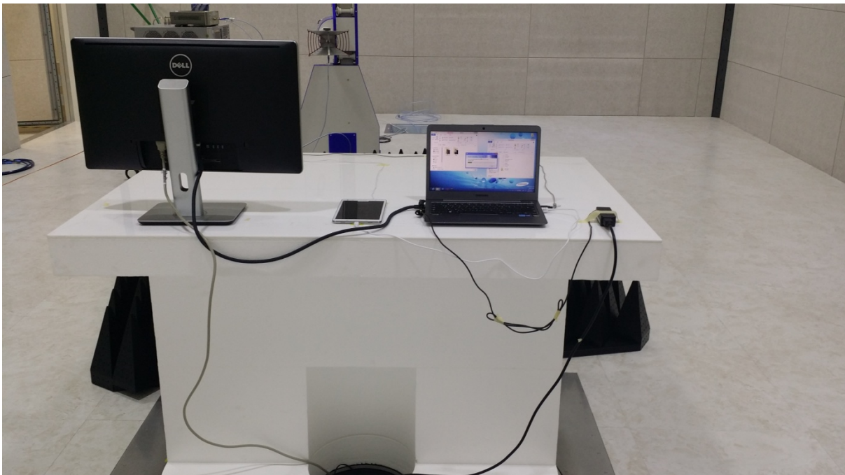
[Radiated Disturbance for Above 1 GHz –Rear]