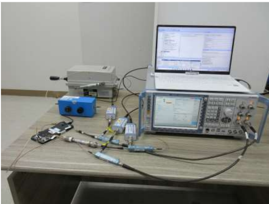
Test setup photo-8 (8-1(f) System level compliance)