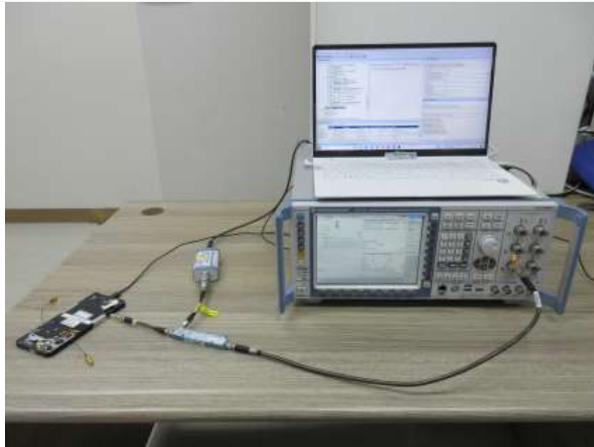
Test setup photo-1 (8-1(a) Legacy)