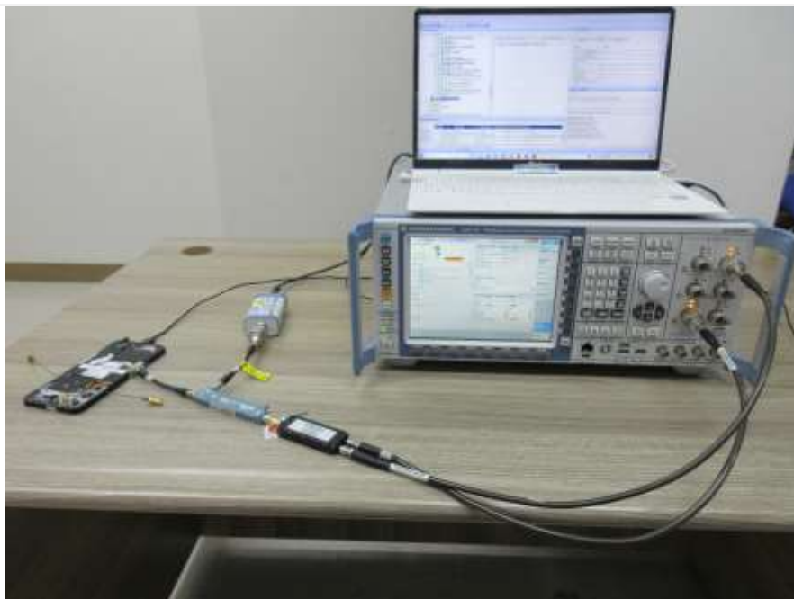
Test setup photo-2 (8-1(b) Legacy)