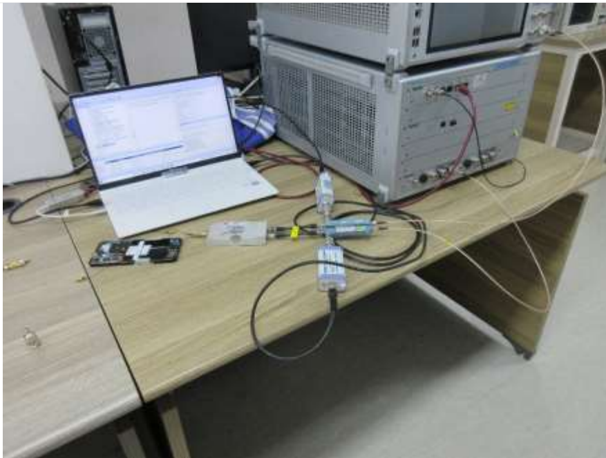
Test setup photo-4 (8-1(b) 5G Sub 6 NSA)