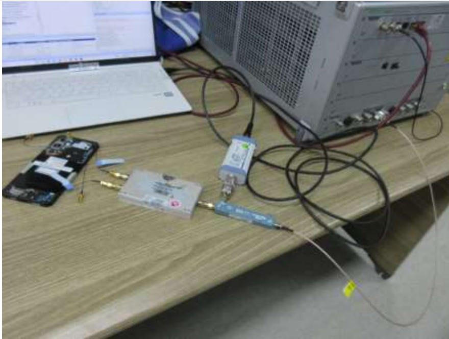
Test setup photo-5 (8-1(c) 5G Sub 6 SA)