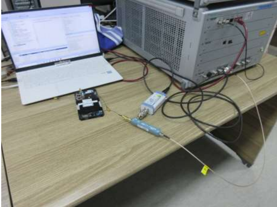
Test setup photo-3 (8-1(a) 5G Sub 6)