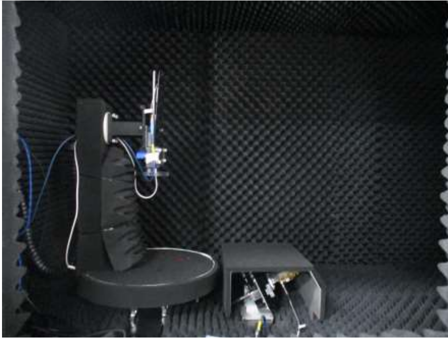
Test setup photo-9 (9-1(a)) mmW NR radiated power measurement