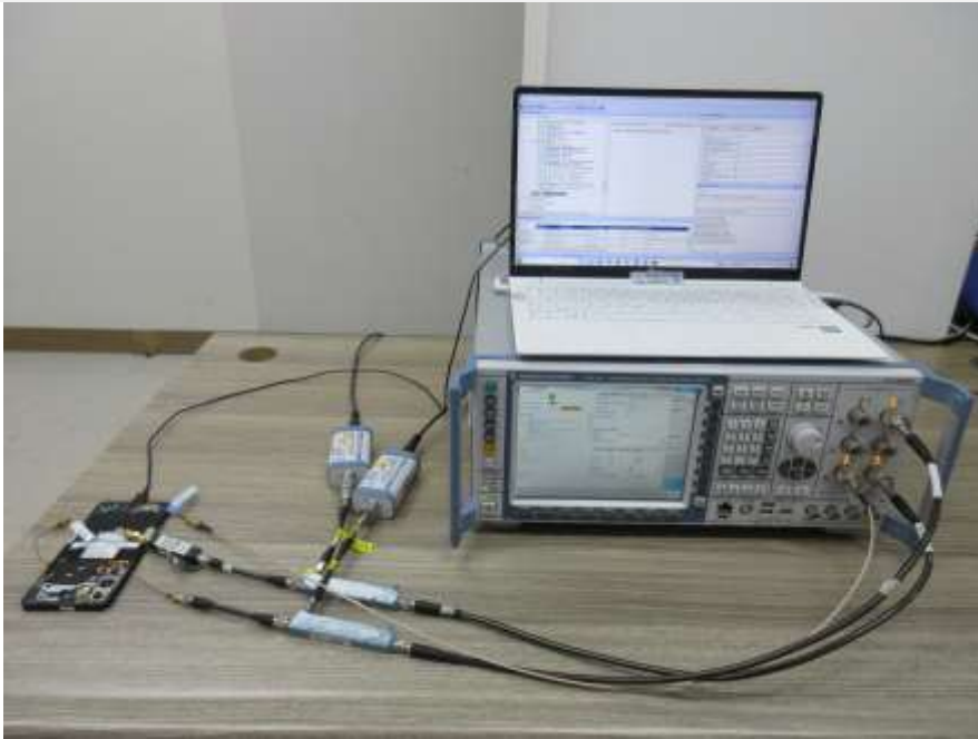
Test setup photo-7 (8-1(e) WLAN DBS)