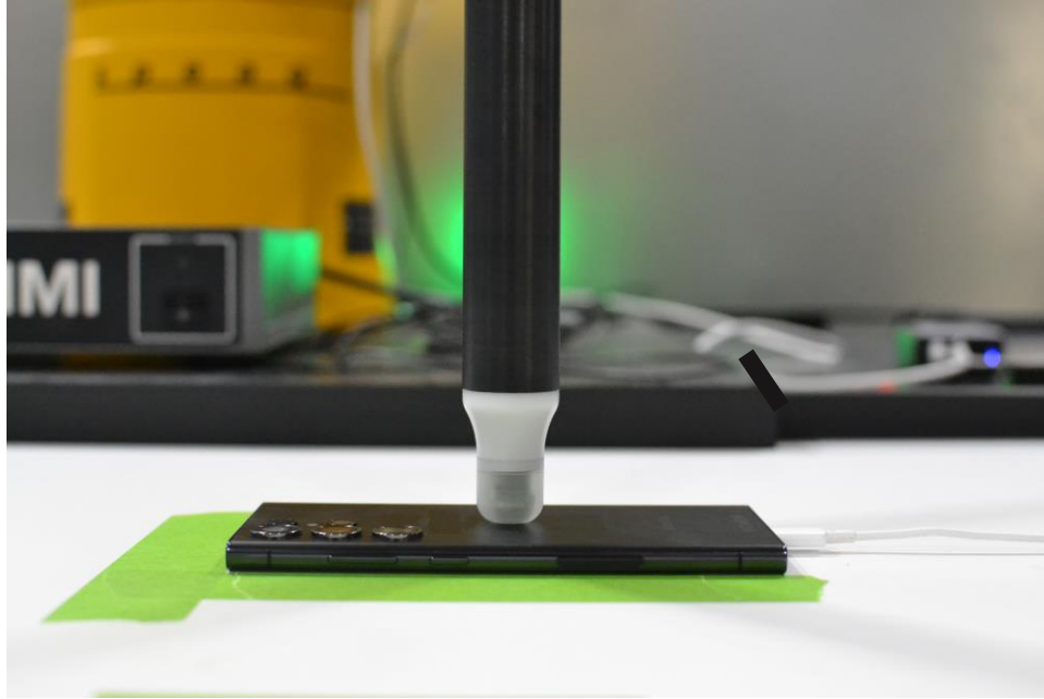
Test Setup Photo 1 – Back Side at 0 mm