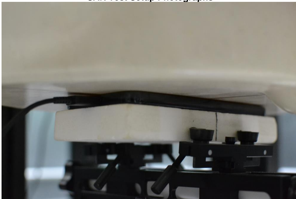
Test Setup Photo 2 – Back Side at 0 mm