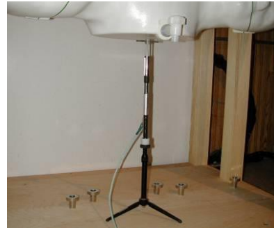
Figure A-2 System Verification Setup Photo