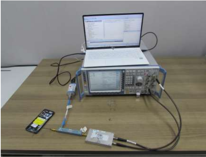
Test setup photo-3 (7-1(b) Legacy Tech Switch))