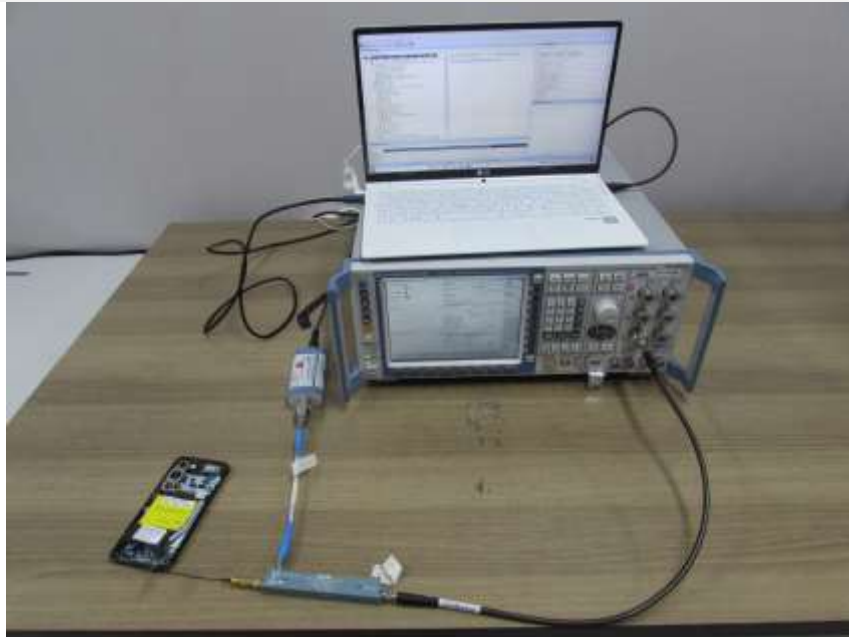
Test setup photo-1 (7-1(a) Legacy)