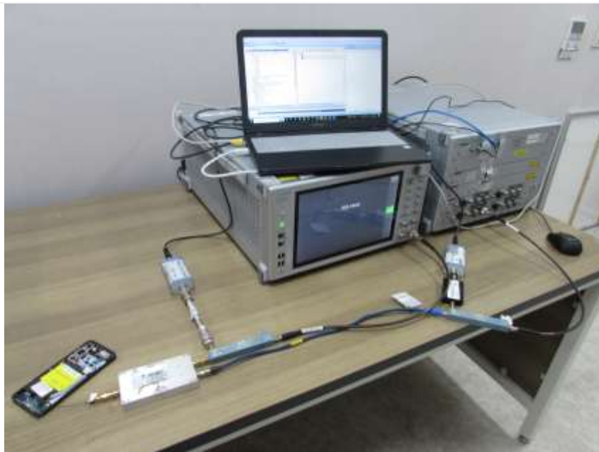
Test setup photo-5 (7-1(c) NR ENDC Power Measurement)