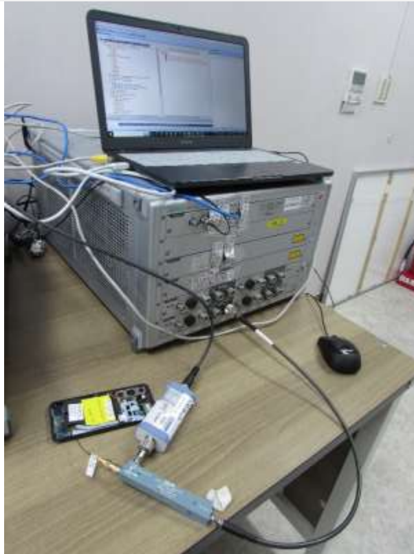
Test setup photo-4 (7-1(c) NR FR1 Power Measurement)