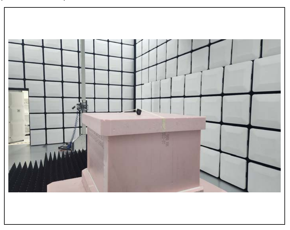
- Above 18 GHz (18GHz ~ 40 GHz)