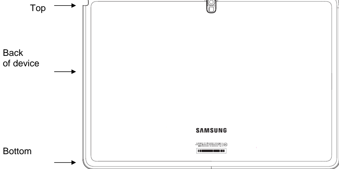
Tablet : FCC ID is printed on bottom of the device

While the rearcase is installed when the unit is shipped from the factory, the battery is already installed prior to sale, so the user don't have to remove the cover in order to install the battery.