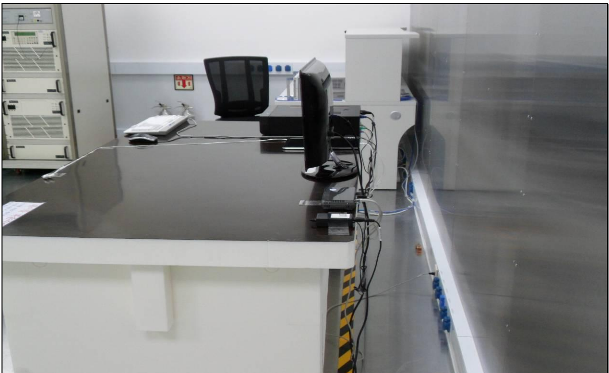
[ Conducted Disturbance – Rear ]