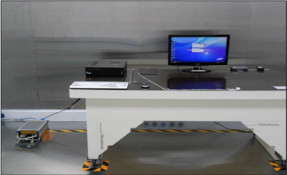
[ Conducted Disturbance – Front ]