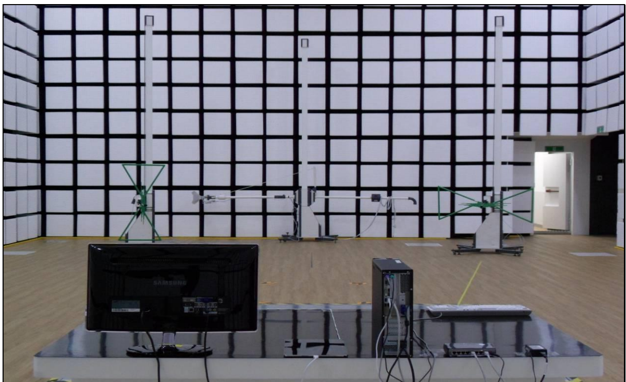
[ Radiated Disturbance for Below 1 GHz – Rear ]