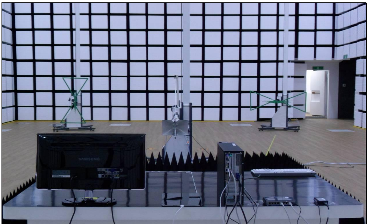
[ Radiated Disturbance for Above 1 GHz – Rear ]