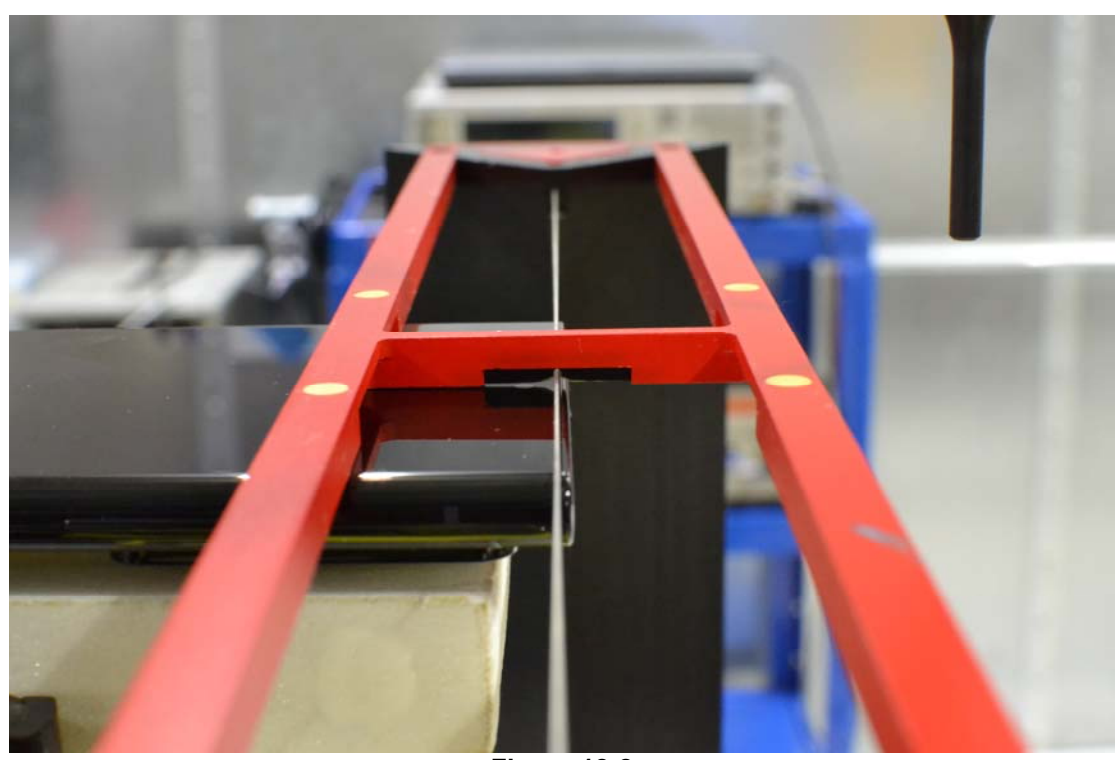
Figure 18-2 HAC Phantom Plane Alignment