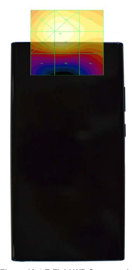
Figure 18-4 E-Field WD Scan overlay